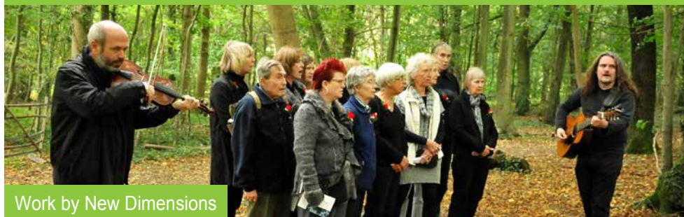
Work by New Dimensions