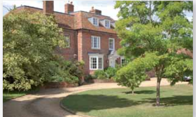
Old Church Farmhouse

Old Church Farmhouse (Grade II) is an important local building reflected in the size and quality of the detailing, including vertically hung sliding sash windows. The building dates from the mid 18th century with 20th century alterations and unusually for this part of the village, is built some distance from the roadside, within extensive grounds.