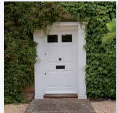
The Vine House

Doors and associated architectural detailing are important features which often complete the 'character' of the building. The significance of doors to the historic character of a building is often overlooked and doors are sometimes replaced with modern replicas of inappropriate detail. The associated architectural detailing of simple porches to small vernacular cottages, or ornate door cases to the more significant buildings reflect the style and period of buildings and the social context in which these buildings once stood.