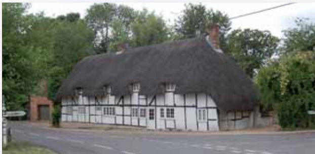
North End Cottage

North End Cottage (Grade II) which was formerly four cottages dates from the 16th century. The timber frame and thatched building stands on a prominent corner and provides an important 'end-stop' to views into the village from the north.