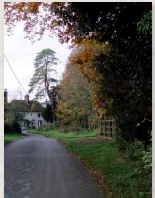
View to Fairfields

A significant part of the character of the village is derived from the contribution made by trees, hedges, open spaces and other natural elements contained within it, including the watercourses.