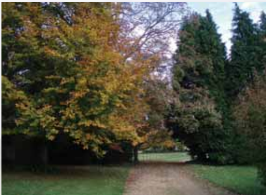
Parkland at Broughton Manor House

in those habitats associated with seasonal or permanent water-logging. Water meadows extend north along much of the Wallop Brook as far as Broughton taking advantage of its relatively steep valley sides. Poplar, alder and willow generally line the watercourses, and field boundaries are predominantly formed by hedgerows and trees. Throughout the valley individual large specimen trees exist especially within the parkland area surrounding Broughton House. 3