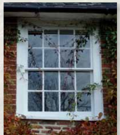
Vine Cottage, Rockery Lane, sash window