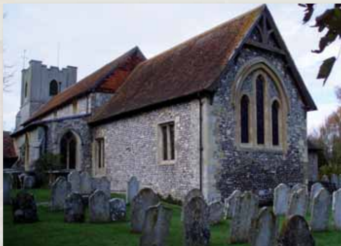
Church of St. Mary the Virgin

The Church of St. Mary the Virgin (Grade II*) is of flint construction and there is evidence of an aisle-less 12th century church, with a nave of the same width as present, extending as far west as the existing aisles. The west tower was built in the 15th century, with the 13th century west door re-set into it. In the early 17th century, the nave and north aisle were