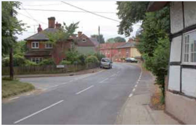
View into conservation area from North End

Properties in this character area are built to a lower density and include