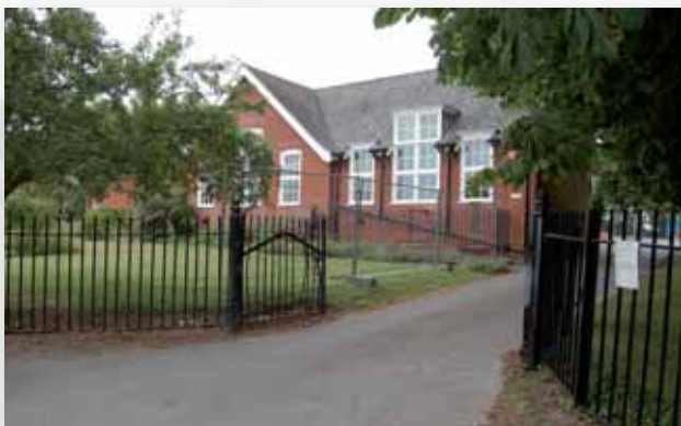
School and railings

North End Cottage (Grade II) which was formerly four cottages dates from the 16th century. The timber frame and thatched building stands on a prominent corner and provides an important 'end-stop' to views into the village from the north.