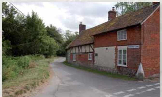
View down Rookery Lane