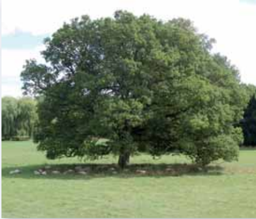
Large oak tree in parkland to Broughton House

It would be unrealistic to identify all trees which make a positive contribution to the character of the conservation area. The most significant trees and groups of trees are shown on the Character Appraisal map. Trees form important backdrops to the village on the valley sides as well as the significant concentration along the Wallop Brook watercourse. Large important tree specimens are scattered throughout the built area of the village, within gardens and are also associated with the parkland to Broughton House and along the edges of the Wallop Brook.