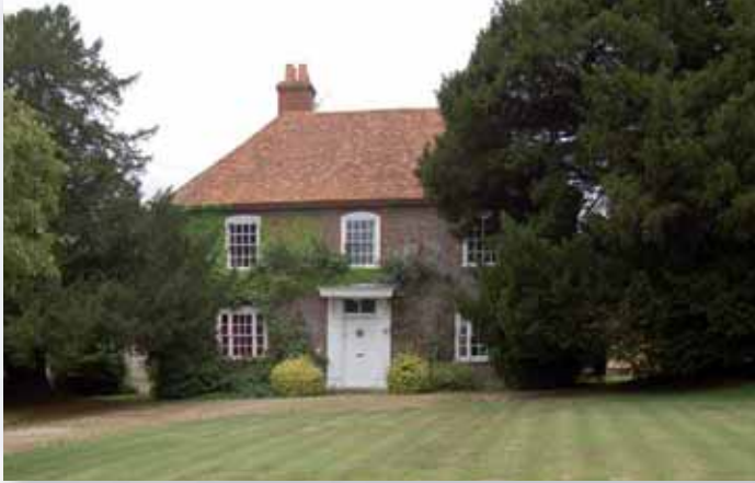
Manor Farm house

This character area is formed by the historic Manor Farm complex which is located at the northern entrance into the village, slightly detached from the more suburban built environment. The complex is bisected by Broughton