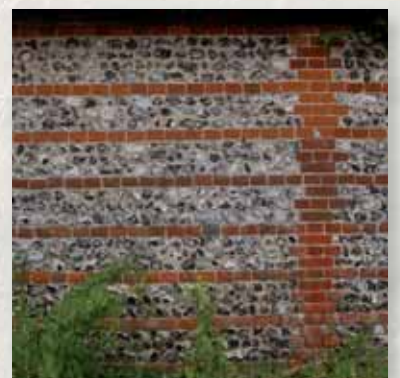
Venison Terrace, detail of brick and flint work