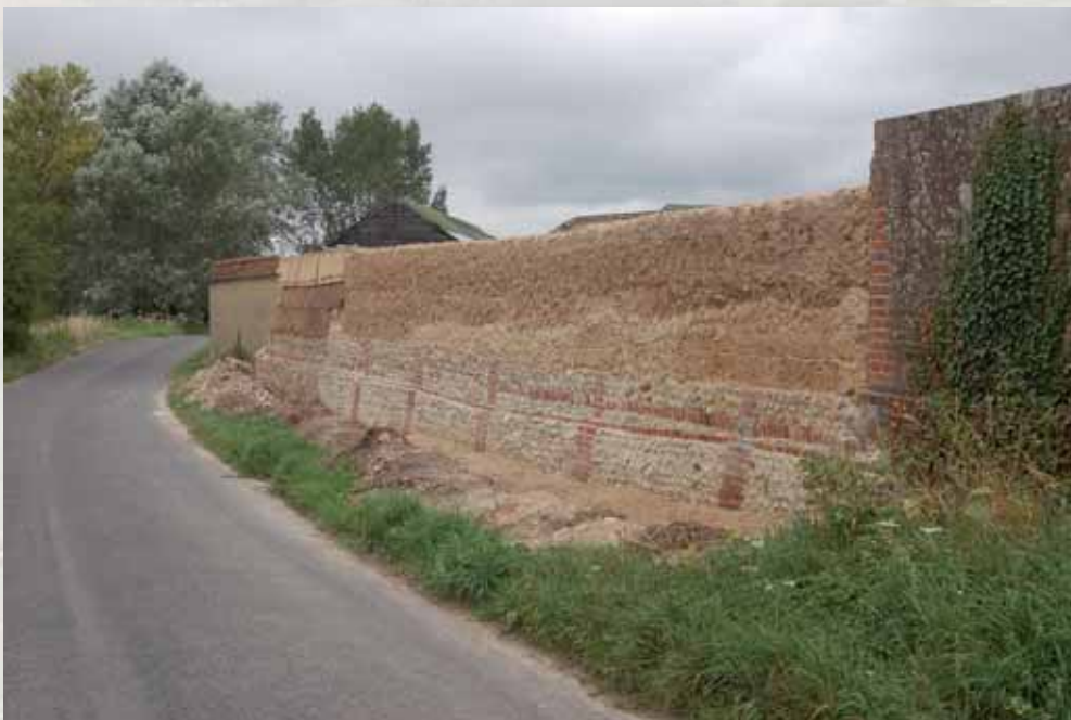
Cob walls and repairs in progress