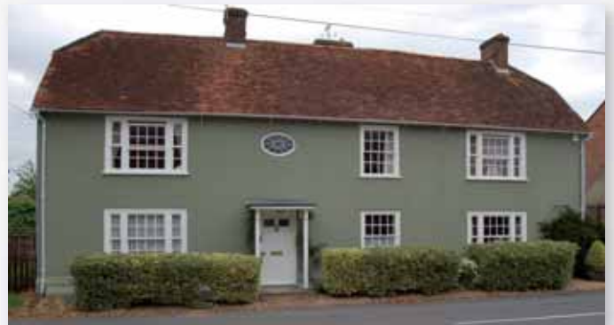
The Old Manse

At the northern end of the High Street are several particularly important groupings of listed buildings. On the east side of the road are The Old Manse, Brigge House, Hanns Cottage, Linden Cottage and Wyncourt House which form a contiguous historic street frontage. Opposite, the listed buildings are set within slightly larger plots, providing a less dense street frontage and include Foords Farm, Eversfield House and Kents Cottage. This latter grouping retains a common rear boundary, backing on to the open area of Fripps Acre Playing Ground with views out of the village to the north. These important groupings form part of the historic backbone of the village street and reinforce the intimate nature of this part of the village.