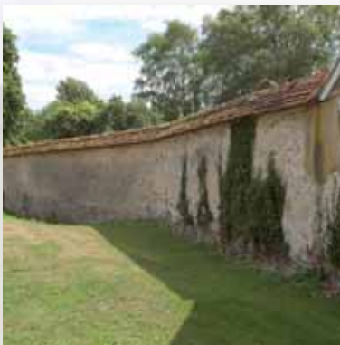
St. Mary's Cottage - cob & flint wall

Garden walls, traditionally detailed fences and other means of enclosure such as hedges (discussed later) are important components and have a significant contribution to the character of the village. Many historic boundaries remain, defining the original plot sizes and are natural or man made.