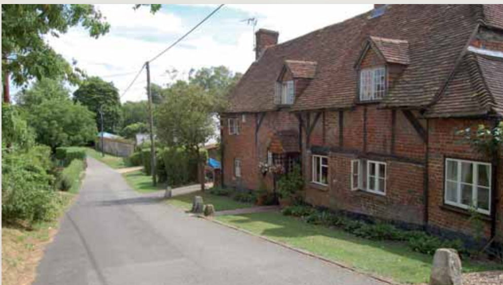
View down Rectory Lane

This character area incorporates the length of Rectory Lane from the junction with the High Street in the west, continuing east over the Wallop Brook, to the north-south public footpath running along the eastern extremities of the village. The lane is characterised by much lower density development in larger, more random plots. There is a less defined building line with buildings randomly placed within the plots and there are a variety of historic boundary treatments, from brick and cob walls to substantial hedgerows incorporating mature trees. The lane is also characterised by the wide verges, especially to the southern side, giving the road a wider appearance than it is in reality.