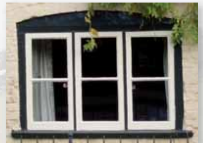
Clifton Cottage, Hampshire casement window