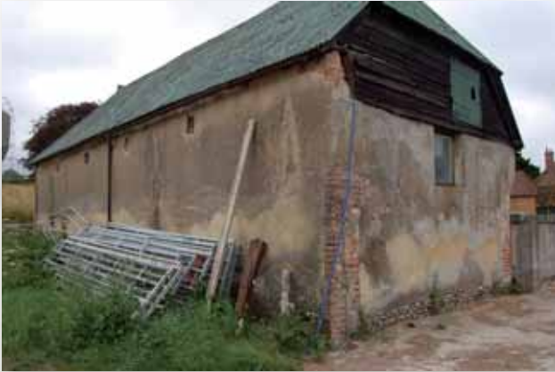
Manor Farm cob barn

There are six Grade II listed buildings within the complex – Manor Farm House, two barns, the granary, the staddle barn and grain mill, and cartsheds. Manor Farm House dates from the late 18th century and is constructed in brick, with decorative blue headers and a slate roof. It has an ornate door case of pilasters with a heavy hood and traditional vertically sliding sash windows, each with 16 panes of glass. The farmhouse sits within a garden area and faces Broughton Road with the farmyards located to the west and south.