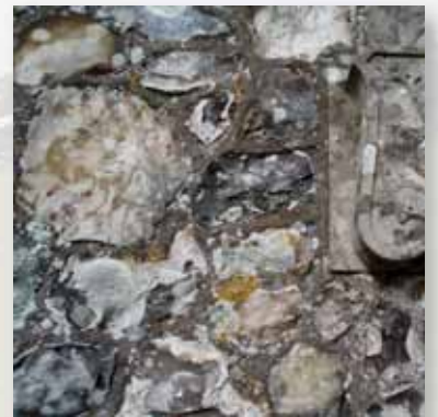
Flint and stonework, St. Mary's Church

There is a considerable amount of weatherboarding found on converted agricultural buildings within Broughton and on parts of dwellings which originally served as stores or ancillary buildings. Weatherboarding is also prevalent on the surviving unconverted agricultural buildings.