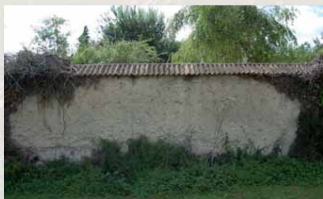
Cob wall behind Village hall