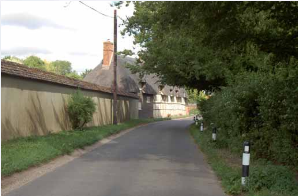
View into village along Horsebridge Road, with Hyde Farm on the left

The main modern north-south valley roads – Romsey Road and Salisbury Road – which form the B3084 runs to the west of the conservation area, along the edge of the modern extension to the village.