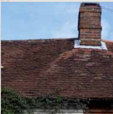
Hanns Cottage and Linden Cottage

As craftsmen, thatchers take great pride in their work and their individual skills are to be respected. While allowing scope for individuality, it is also important to maintain local distinctiveness if the special character of the area is to be preserved. Historically, thatched roofs in Test Valley have adopted a simple profile with minimum punctuation by dormer windows and other adornment. The appropriate ridge for a long straw roof is termed 'flush and wrap-over' (i.e. sits flush with the main roof slope). Combed wheat reed on the other hand often has a block ridge (one that stands proud) which can be plain or decorated. In the interests of maintaining the simplicity and distinctiveness of the local tradition, the Council encourages the use of flush and wrap-over ridge on both long straw and combed wheat reed roofs.