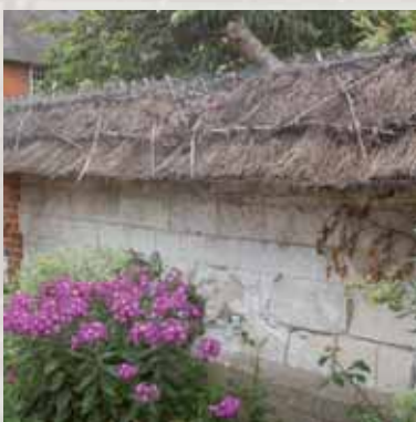
Dixon's House, Chalk clunch wall

One particularly attractive traditional boundary is the thatched or tiled cob walls which are prevalent throughout the Wallop Valley and there are some important surviving examples within the village. These types of wall generally define the gardens or original farmyard areas and there are particularly important examples at Manor Farm and to the rear of Cob House off Paynes Lane. The boundary wall at Dixon's House is particularly unusual being constructed of 'clunch' which is squared chalk blocks – possibly sourced from the historic chalk quarry to the south of the village at Bossington. Farmland is still generally defined by either hedgerow or traditional post and rail fence.