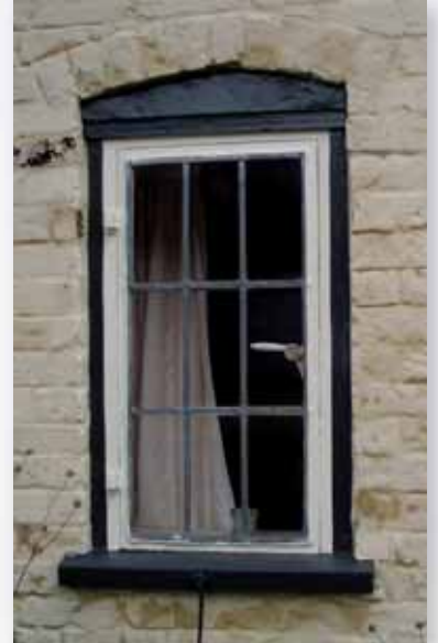
Clifton Cottage, leaded light window

The majority of windows in Broughton are of a reasonable standard of design. Fortunately, the use of non-traditional materials, such as PVCu, has so far been largely avoided. While aspirations to improve thermal insulation are understood, wholesale replacement of well-designed traditional windows can rarely be achieved satisfactorily using sealed double glazed units. A more appropriate solution is likely to be through proprietary draught stripping and secondary glazing. Existing windows should be retained, repaired or remade to a design appropriate to the period and design of the property.