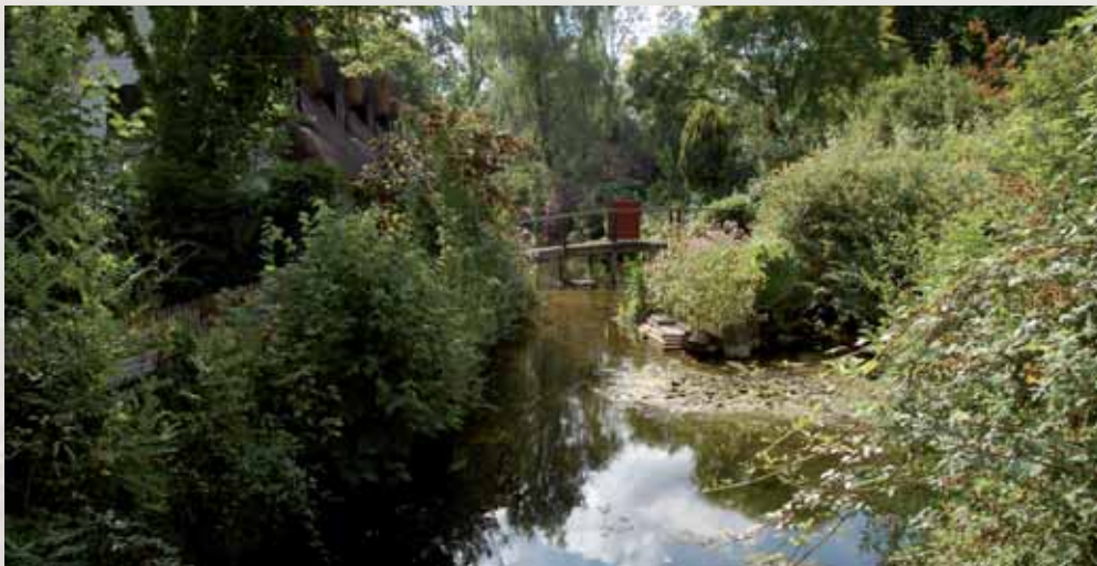
View down river towards Old Mill Cottage