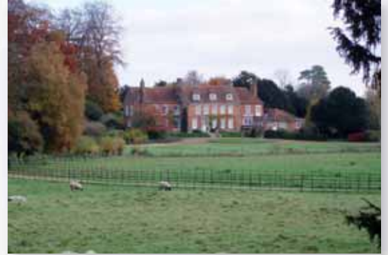
Parkland around Broughton House

Views are gained to the south across the parkland of Broughton House and more intimate glimpsed vistas are allowed to the north and south along the Wallop Brook from the bridge over the watercourse. The eastern end of the lane rises out of the valley and undergoes a transition from vehicular width to pedestrian footpath in a matter of metres. Further wider views across the arable countryside to the east are gained at the junction with the main north-south footpath. More intimate views can also be gained from the rear part of the churchyard, through to the dovecote building.