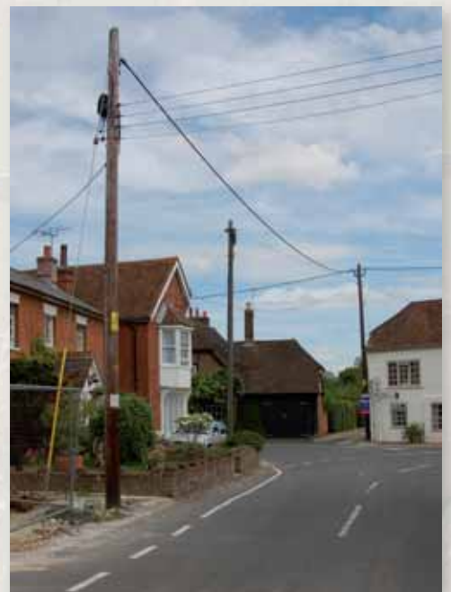
Overhead wires in the High Street

The most intrusive feature within the conservation area is the prevalence of overhead wires, which are particularly dominant within the historic streetscene.