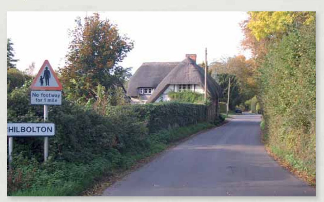
View into conservation area along Winchester Street

The public footpaths entering the village from the south and the north were probably once more formal track ways and are historic entrances into the village.