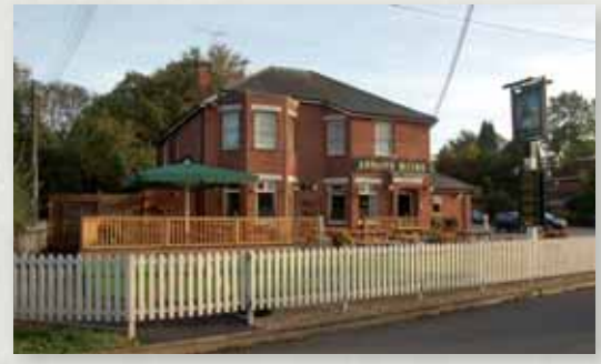
Abbots Mitre Public House

and is notable for its 'wavy' Victorian bargeboards on the gables facing Village Street. The Abbots Mitre PH is perhaps more significant to the conservation area in relation to its social importance in the village than as a particularly architecturally special building. The survival of such a facility within a small village is key to the retention of an integrated and thriving community.