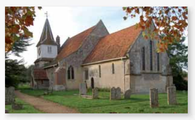
Church of St. Mary the Less

13th, 14th and 15th century additions which underwent a major restoration in the Victorian period. The Church is constructed of flint rubble which has been rendered in areas, with some stone dressings, including buttresses, windows and a plinth. The tower is constructed in three stages – flint walls with a tiled roof, linking to the narrow bell stage, which has weatherboarding on a timber frame, leading to the top, which is the tiled spire.