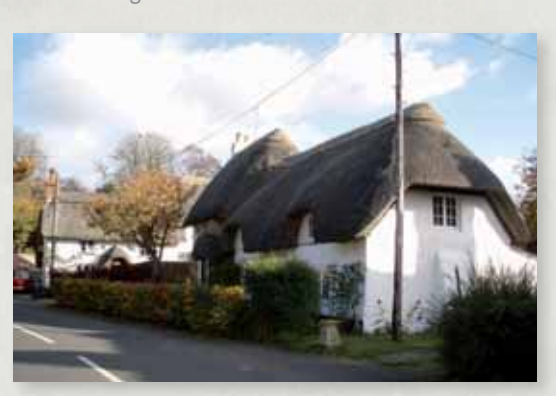
Whiteways and Heather Cottage

road, with modern properties set further back within plots. Boundary treatment is a mixture of traditional hedge or wall and an increasing prevalence of modern inappropriate close boarded fencing.