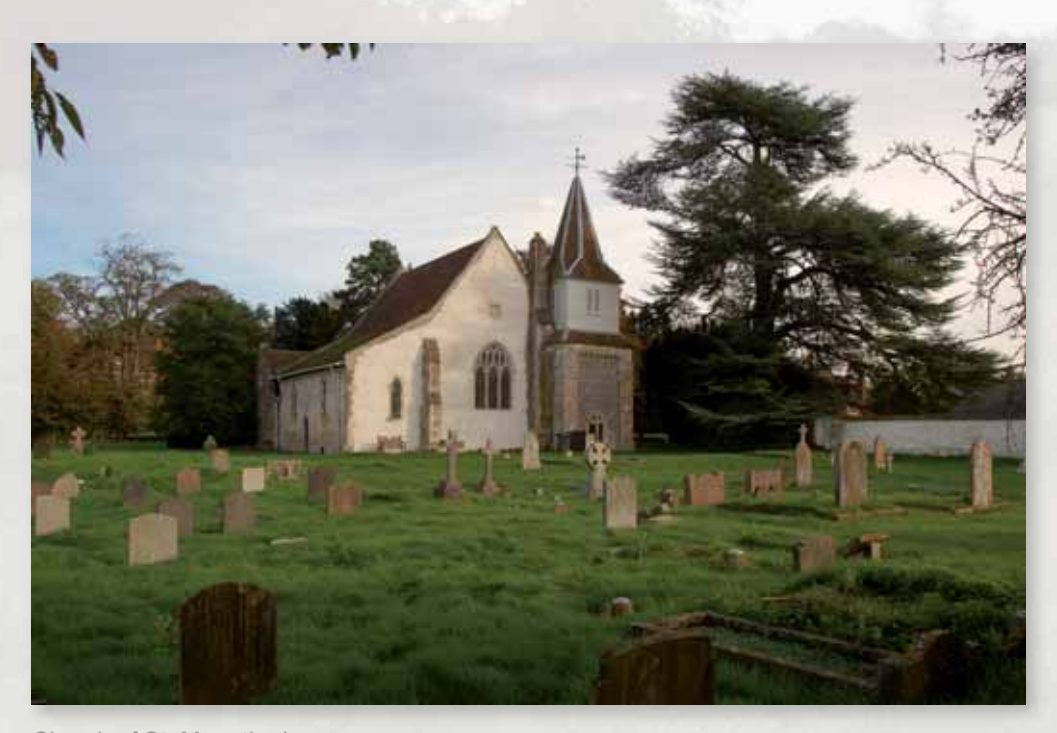
Church of St. Mary the Less