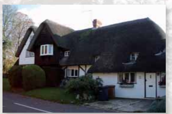
Chilbolton Cottage and Spring Cottage

This character area has a relatively high density of properties, with large radiating plots on the inside of the bend in Village Street to the north and more regular long and deep rectangular historic plots to the southern side. The general street scene is of more traditional buildings on the edge or close to the