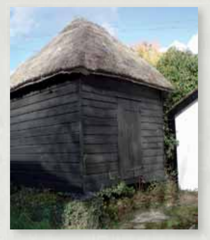
Granary on straddle stones

intimate character. The road widens at two points along its length, including at Grindstone Green adjacent to Abbot's Rest, creating intermediate focal points.