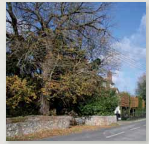
Trees along Village Street