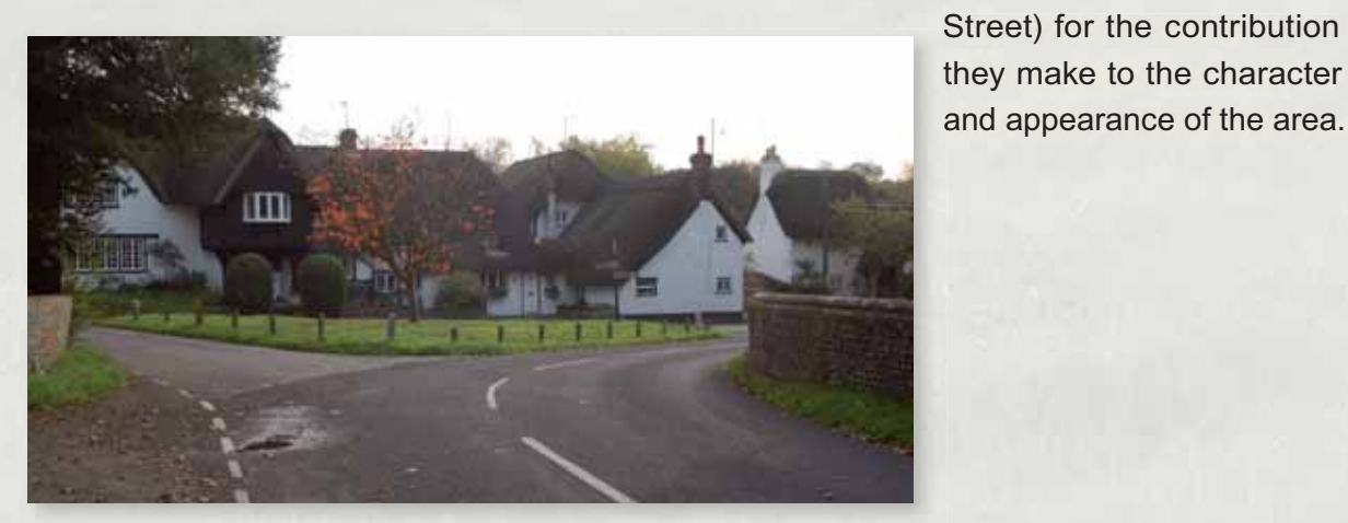
The historic core of the village

Other amendments include the addition of Brambledene, Field Corner and Hookley Down and part of the garden to Yew Tree Cottage (all on Winchester