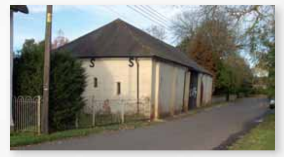
Cob barn, Bannuts Farm

Further south, on the same side of the road, Abbot's Cottage (Grade II), a rendered cob and thatched 18th century building, is particularly prominent in