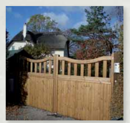
There are several examples of historic flint, cob or brick boundary walls in the village, but these are generally to the more important or grander buildings such as the Church, Church Farmhouse and Northwood House. Generally the majority of properties, including modern dwellings, have retained an historic method of defining the boundary, either by brick or brick and flint walls, or by hedgerows. There is an unfortunate move towards the use of close boarded fencing of various heights and these are alien features, detracting from the historic character of the conservation area.

Garden walls, traditionally detailed fences and other means of enclosure such as hedges (discussed later) are important components which can make a significant contribution to the character of the village. Many historic boundaries remain, defining the original plot sizes and are natural or man made.