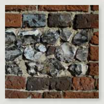
Northwood House barn brick and flint

the village. Flint occurs naturally within the downland chalk landscape and provided a readily available building material, which was widely used in traditional vernacular buildings up to the 20th century. The flints were normally 'knapped' or dressed to provide a flat, often 'squarish' shaped outer surface, which created a regular 'plane' to the wall. Bricks were initially used to create the 'corners' of buildings and the more structural elements such as lintels and door openings, but were later used to create decorative patterns, such as those to the outbuilding to Northwood House which provides an important visual termination to views across Stocks Green.