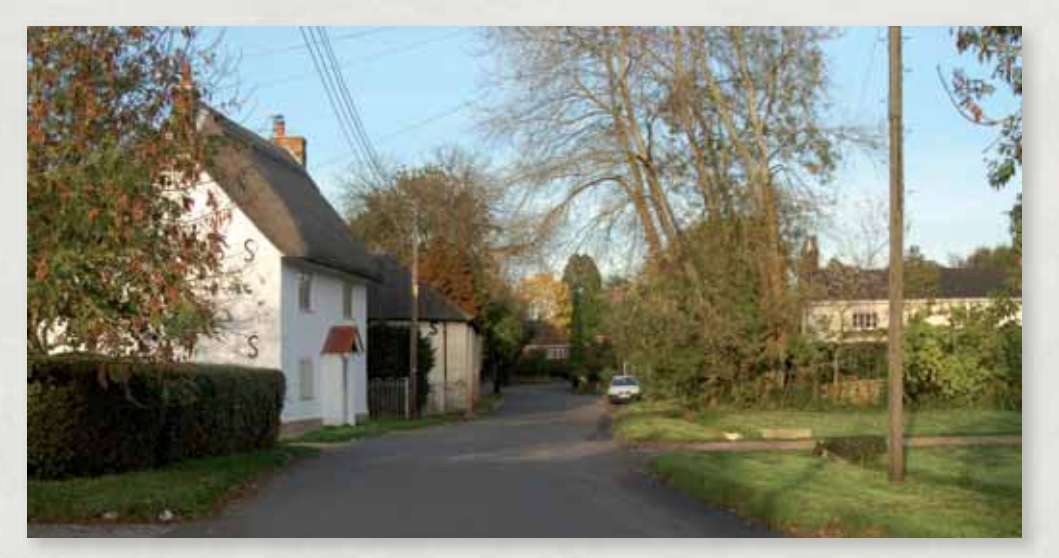
View down Village Street

The most important views looking into, out of and through the conservation area are shown on the Character Appraisal map. These contribute to the character and setting of the conservation area and care needs to be taken to ensure that these are not lost or compromised by inappropriate development or poorly sited services.