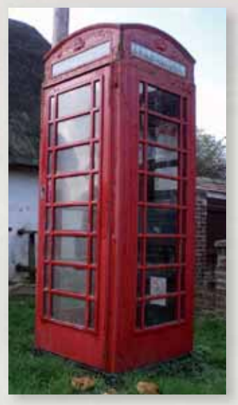
K6 Telephone Kiosk

The location of Chalkdell, an early 19th century building with shuttered cob (rendered at the front) and a clay, pegged tiled roof, is particularly important as it provides a visual termination to views south along Joy's Lane when entering the main part of the village from the Chilbolton Cow Common. The building has a pleasant symmetrical façade with timber vertically sliding sash windows and a half glazed door with fanlight over.