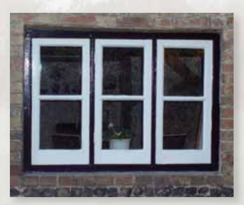
Yew Tree Cottage casement window

There are a number of traditional styles of window within the conservation area, including timber windows with traditionally glazed leaded lights formed of individual 'quarries' of glass (individual diamond or square pieces of glass) with lead 'cames' (the lead which connects the individual pieces of glass together); and cast iron framed and small paned windows, often with decorative window 'furniture', i.e. catches and window stays. One of the styles found in the conservation area is commonly termed the 'Hampshire casement'. This is a well proportioned single glazed timber window with a single horizontal glazing bar equally dividing the panes.