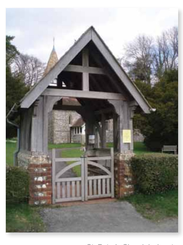
St. Peter's Church lych gate

St. Peter's Church (1871) designed by William White incorporates a Norman doorway, window and font from the old church. It is a charming flint building with stone dressings and a tiled roof. The bell turret with its exposed timber frame and broach spire covered with shingles is another distinctive landmark within the village. There is also a lych-gate with details echoing those of the Church. Adjacent to the Church is the Old School House, also built in 1871 and also likely to have been designed by William White. This tiny school, described by Pevsner as being "unquestionably more fun" 17 than the church, is also built of uncoursed flintwork with brick dressings, includes gothic windows and an octagonal spire also covered in shingles. The school was designed to accommodate 30 children, but closed in 1938, to be used temporarily as the estate office, but more recently has been extended to form a dwelling.