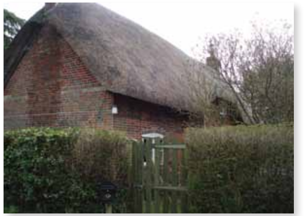
Cleve Hill Cottage

The former Manor Farm – now known as The Old Farm House is at the head of a small coombe (short valley) with a pond at the head<sup>14</sup>.