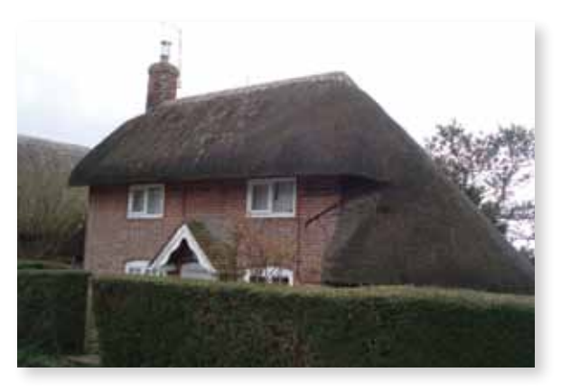
attic and is a timber framed hall-type house with later brick cladding and chimneys at either end. It is surrounded by a hedge and includes a simple picket gate. No. 17 which is built close to the road is a late 18th century brick and thatched cottage with a symmetrical front and outshots at either end.

Nos. 16 (Cleve Hill) and 17 form an interesting pair of Grade II listed cottages on the southern side of Rockmoor Lane which back on to the cricket field. They occupy smaller plots than those on the northern side of the Lane. No. 16 which is situated at right angles to the road is a single storey thatched cottage with