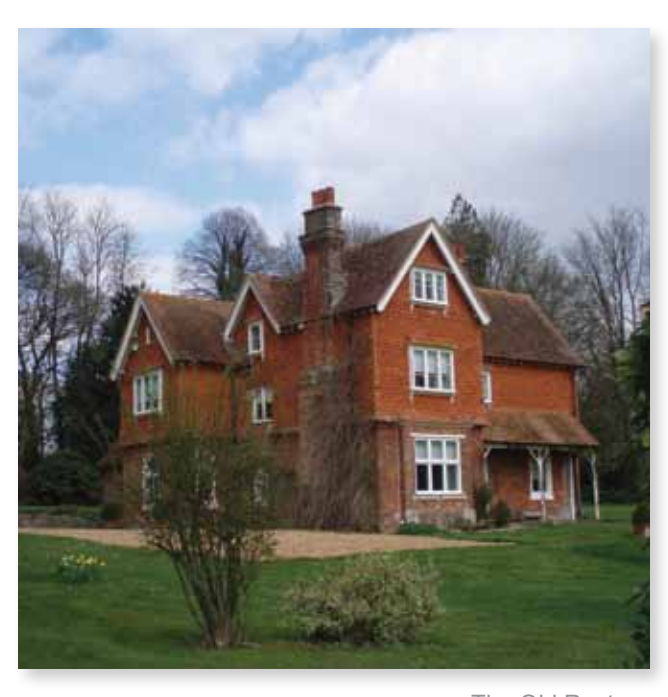
The Old Rectory