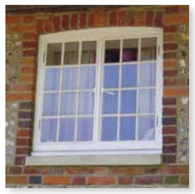
Metal casement window, Jesse