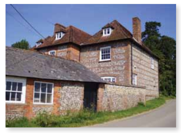
The Old Farmhouse

The tithe map shows a small group of buildings to the south eastern edge of the village including The Old Farmhouse (formerly Manor Farm) and associated buildings. The east-west road links the farm to the manor centre with late 19th and early 20th century development along the southern side of the road.<sup>13</sup>