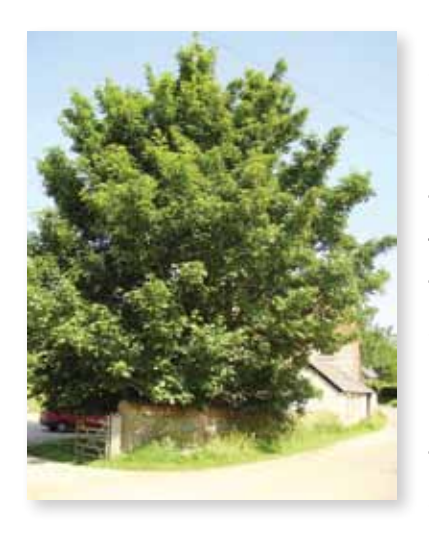
Tree, Upton Lane, Old Farm House

It would be unrealistic to identify all trees which make a positive contribution to the character of the conservation area. The most significant trees and groups of trees are shown on the Character Appraisal map including a number of fine specimen trees in the parkland associated with the Manor House. Trees form important backdrops to the village as well as to the rear of the property boundaries. A few larger individual tree specimens are dotted through the conservation area within gardens.