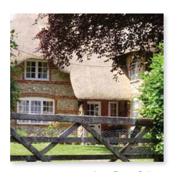
Jesse Dewey Cottage