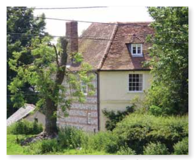
The Old Farm House

Other buildings include The Old Farm House – an 18th century brick and flint house with clay tile roof, fine sash windows and a simple door with a canopy above. There is a range of good quality brick farm buildings to the south of the house one of which incorporates a plaque bearing the date 1900. Properties in this character area are mainly enclosed by hedges, with a flint and brick wall to the side of The Old Farm House and metal railings around The Old Clockhouse. This area also includes the triangular 'green' at the junction of Upton Road and Rockmoor Lane. This an important focal point within the village and