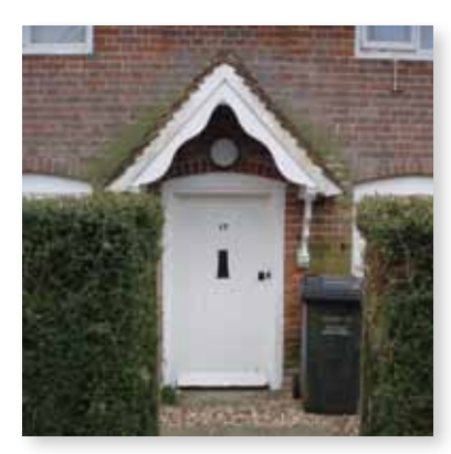
Rockmoor Lane, no.17

Doors and associated architectural detailing are important features which often complete the character of the building. The significance of doors to the historic character of a building is often overlooked and doors are frequently replaced with poorly designed modern replicas. The associated architectural detailing of simple cottages, including porches and canopies, reflect the style and period of individual buildings and the social context in which these buildings once existed.