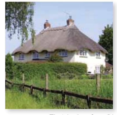
Thatched roof: no.21

Clay tiles (mainly handmade) are also commonly used in the village, with natural slate used from the 19th century onwards. There is also some later use of concrete tiles. Unfortunately, this material has a much heavier profile than clay tiles and can often be overly prominent, therefore its use is discouraged within the conservation area.