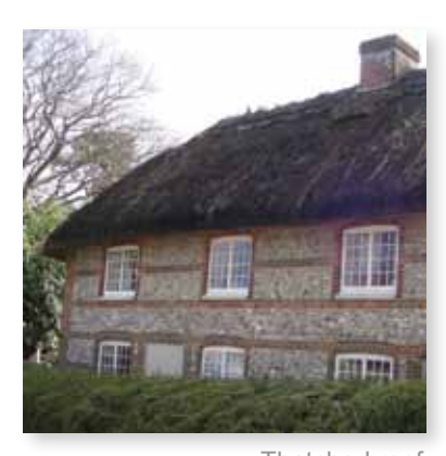
Thatched roof: Jesse Dewey Cottage

There are a few examples of thatched roofs within the conservation area (notably No.8 Jesse Dewey Cottage, Nos. 16, 17 and 21). Evidence indicates that long straw was the prevailing thatching material in the area, however since the middle of the last century combed wheat reed has assumed greater prominence and is now the main thatching material in the village. The practice when re-thatching, is to spar coat a new layer of thatch onto the roof, hence in the majority of cases, the base layers are a century or more old. This historic base layer is an invaluable archaeological resource and should not be disturbed.