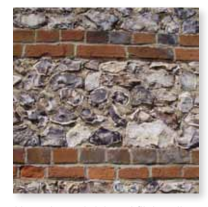
Upton Lane, brick and flink wall to Old Farm House

Later buildings were often constructed of brick only and include details such as tile hanging (at The Manor House and The Old Rectory), sham timber framing (to the upper storeys at Nos. 9 -14 Rockmoor Lane) or painted render (as at Nos. 21, 3-6 New Cottages and Gardeners Cottage). Paint colours are generally restricted to subtle shades of cream or off white.