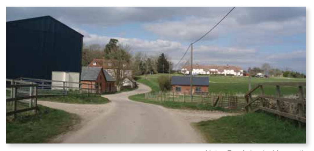
Upton Road view looking north