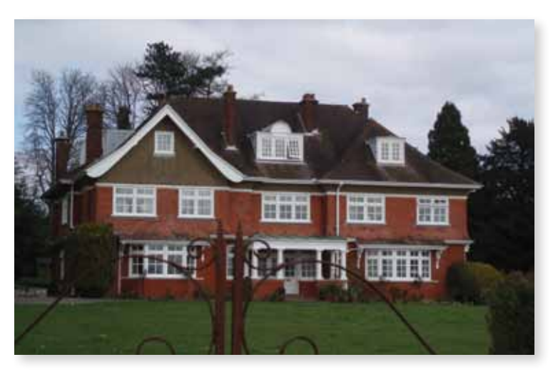
The Manor House

The Manor House is the most distinctive of the unlisted buildings within this character area and possibly merits consideration as a listed building in its own right. It is a large early 20th house occupying a large plot with a low hedge and gates to the front providing open views of the house. There is a dense hedge and high gates to the main entrance and several mature trees mainly to the rear of the house. The house, which has forty two rooms, is in a free Queen Anne Revival style and was designed by the London architect Charles Watkins in 1905. Built of brick with tile hanging on the first floor and a clay tile roof, there are