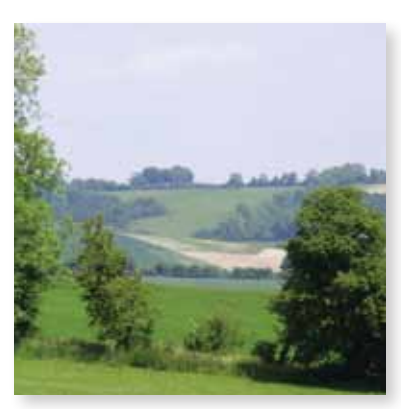
View looking east

The most important views looking into, out of and through the conservation area are shown on the Character Appraisal map. These contribute to the character and setting of the conservation area and care needs to be taken to ensure that these are not lost or compromised by inappropriate development or poorly sited services.