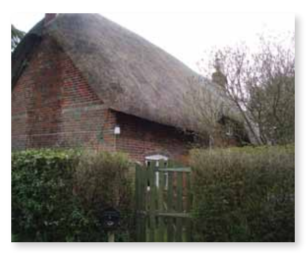
No. 16 (Cleve Hill)

This character area is the core of the village with the majority of key and listed buildings, mainly built in the 19th and 20th centuries. The oldest dwelling is No. 16 (Cleve Hill) which dates back to the 16th century.