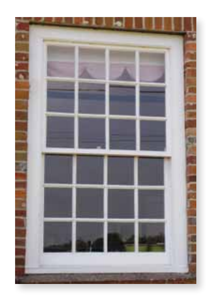
Sash window, Old Farm House

There are a number of traditional styles of window within the conservation area, these are mainly constructed of timber but there are also some examples of metal casement window (for example at Jesse Dewey Cottage).