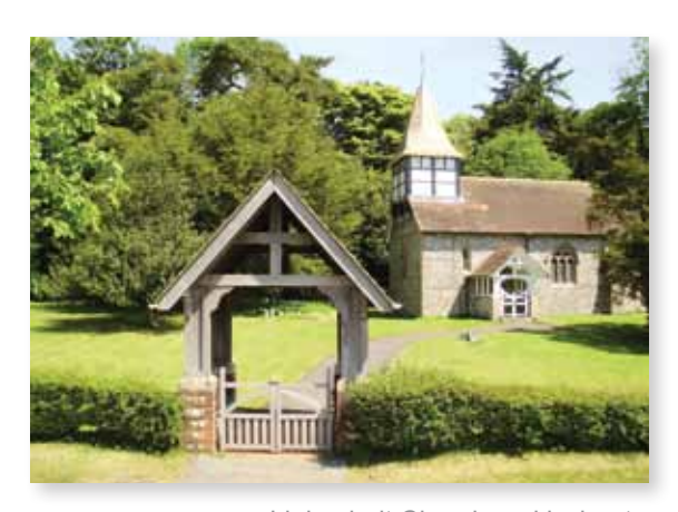
Linkenholt Church and lychgate