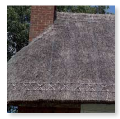
Thatched roof, Apple Thatch

Clay tiles (mainly handmade) are also commonly used in the village, with natural slate used from the 19th century onwards. There is also some later use of concrete tiles. Unfortunately, this material has a much heavier profile than clay tiles and can often appear prominent; therefore its use is discouraged within the conservation area.