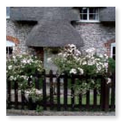
Picket fence, Meadow Cottage

On the whole, the majority of properties, including modern dwellings, have retained a historic method of defining the front boundary to the garden. In Vernham Dean, this is generally using hedgerow, but some examples of brick, brick and flint or cob walls, exist at the eastern and western ends of the village.