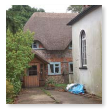
Cheyney Cottage behind Methodist Chapel