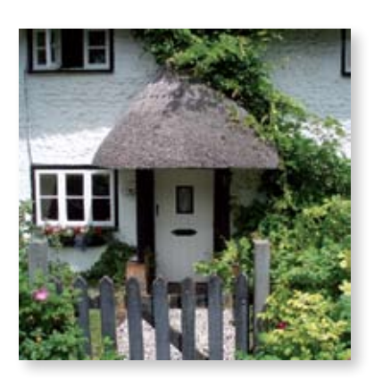
Porch detail, Lilac Cottage

Doors and associated architectural detailing are important features which often complete the 'character' of the building. The significance of doors to the historic character of a building is often overlooked and doors are replaced with modern replicas of inappropriate detail. The architectural detailing of porches, varying from simple designs for cottages, to the ornate door cases on the more imposing buildings reflect the styles and periods of the buildings and the social context in which they once stood.