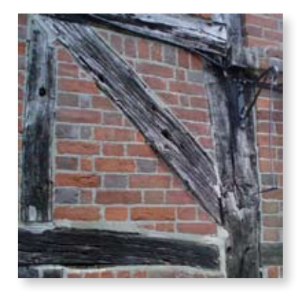
Timber Framing, George Inn