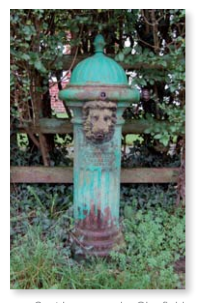
Cast Iron pump by Glenfield and Kennedy Kilmarnock