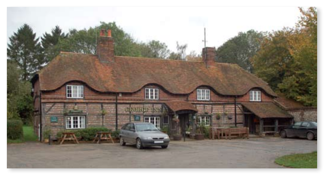
The George Inn

There are six Grade II listed buildings within the character area, including: The George Inn, Pond Cottage, Beeches Farmhouse, Gardia, Apple Thatch and Dean Cottage.