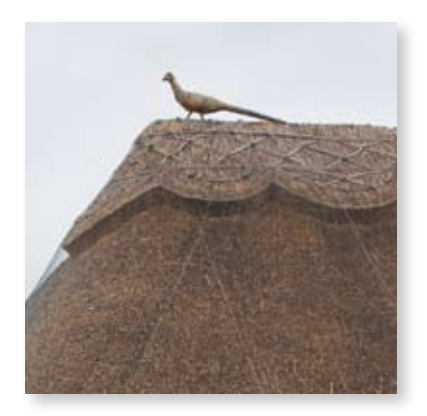
Thatched pheasant, Pond Cottage