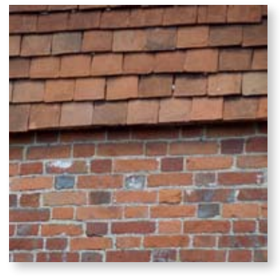
Brick and hanging tile, All Ways