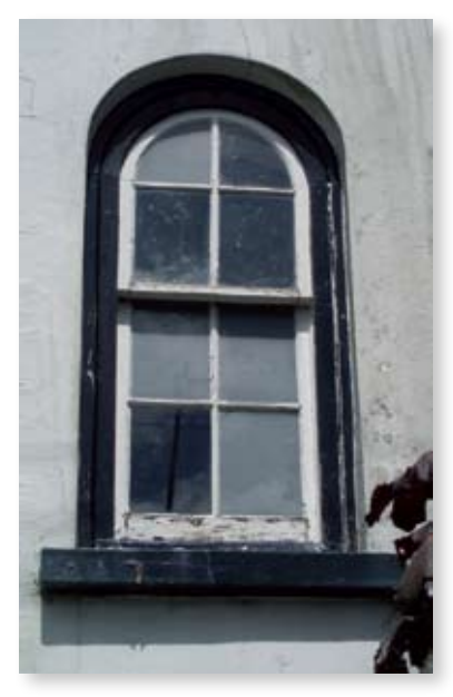
Sash window, Chapel

In the late 18th century or 19th century more significant buildings included small paned timber vertically sliding sash windows which demonstrated the wealth of the owners at that time.