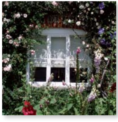
Casement window, Apple Thatch

Windows are a critical element of a building's design and even subtle changes can significantly alter the character. As distinct from their modern counterparts, traditional windows found in older properties are designed with the sub-frame and opening or fixed light flush, as opposed to the cruder design found in storm proofed windows. This produces a more harmonised design. Likewise, the position of the window in the wall, whether flush or set in a reveal and the form of the glazing bars affects the play of light and shade, again significantly affecting the visual appearance.