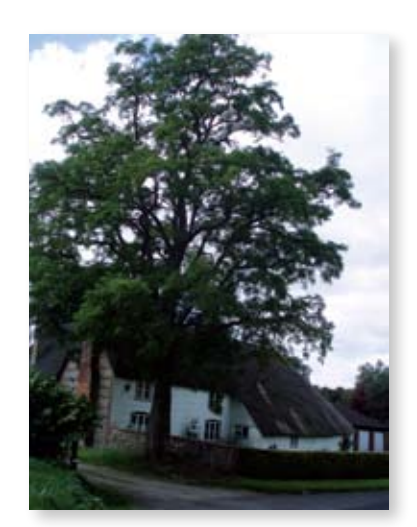
Tree at Poplars Farmhouse

It would be unrealistic to identify all trees which make a positive contribution to the character of the conservation area. The most significant trees and groups