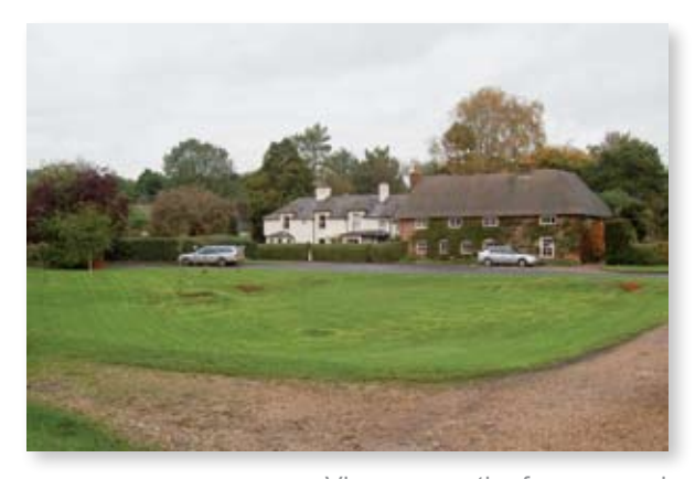
View across the former pond

slightly larger, more important late 19th century dwellings. The buildings are generally located towards the front of plots, with the exception of Dean Cottage and Gardia. The historic plot pattern surrounding this area can still be discerned, with no modern infill having taken place within the conservation area boundary.