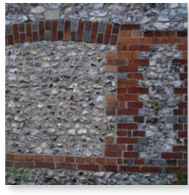
Brick and flint, The Old Forge

Older properties are generally constructed of brick and flint, with some areas of timber framing, often in gable ends. Where timber framing is evident, there is a variety of materials used for the infill panels, including wattle and daub, cob, brick and flint. Flint is a material occurring naturally within this chalk landscape and provided a readily available building material, which was widely used in traditional vernacular buildings up to the 20th century. The flints were normally 'knapped' or dressed to provide a flat square shaped outer surface, which created a regular 'plane' to the wall. Bricks were initially used to create the 'corners' of buildings and the more structural elements such as lintels and door and window openings, but were later utilised to create decorative patterns, such as those at Apple Thatch and Denver Cottage.