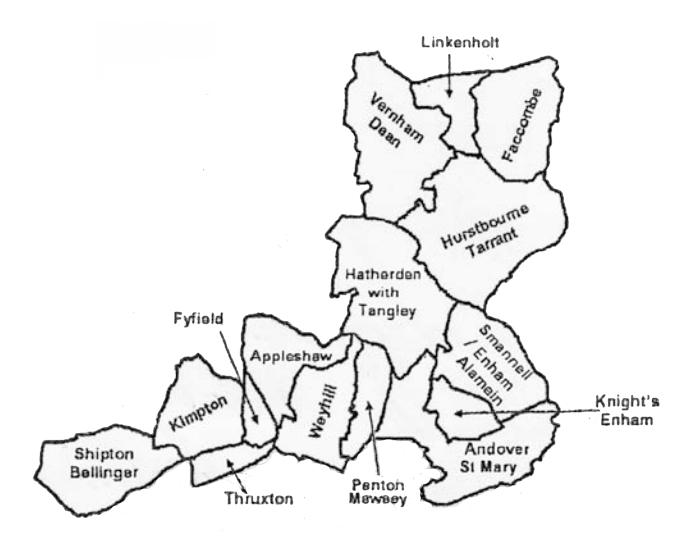
Map of Andover Town (North) and Parishes

If you enjoyed visiting the churches of Andover Town and the North Parishes, you may be interested in our other leaflet entitled "Churches in and around Andover Town (South)".