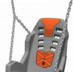
K - 'Mirage' inclusive seat (88020801)