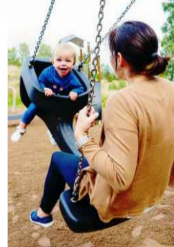
I - 'Tango' dual generation seat (HAG8053217)