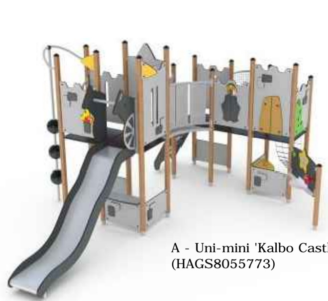
A - Uni-mini 'Kalbo Castle' (HAGS8055773)