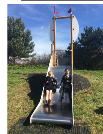
L - 'Castle style wide Embankment Slide (SP6041)