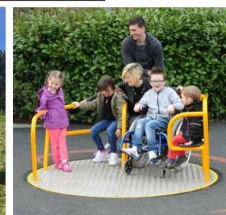
M - 'Spinmee' flush to ground wheelchair roundabout (CAR-SPI)