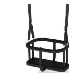
H - 'Kiddy' cradle seat (HAG8001001)