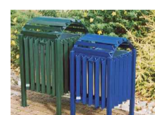
O - 1no. Streetmaster Cardiff Litter Bin