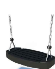
J - 'Katja' flat seat (HAG8001000)