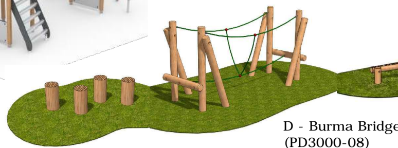
D - Burma Bridge (PD3000-08)