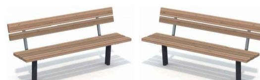
N - 3no. 'Ekeby' seats with back rests