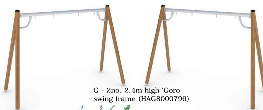
G - 2no. 2.4m high 'Goro' swing frame (HAG8000796)