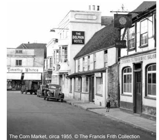
The Corn Market, circa 1955.

The Corn Market was only created as a separate street once buildings were erected in the centre of the Market Place, thus cutting it off from the rest of the market area. Until the 19th century the street was called the Pig Market.