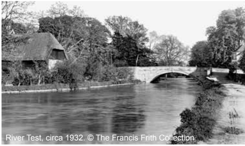
River Test, circa 1932.

The main water channel is here, to the west of Romsey, and until the water flow was altered in the 1990s, the mill race at Sadler's Mill attracted crowds of visitors every autumn who came to see the salmon leaping through the rushing water as they made their way upstream to spawn.