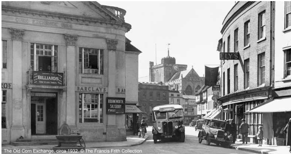
The Old Corn Exchange, circa 1932.

Originally it had windows like those on the Town Hall, but its façade was altered in the 1920s. In front of it is a drinking fountain provided by William Cowper Temple, Lord Mount Temple, the owner of Broadlands, in 1886.