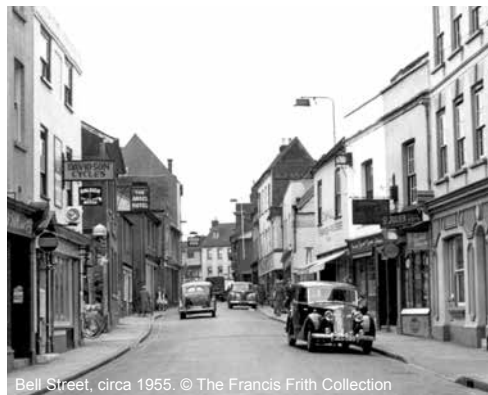
Bell Street, circa 1955.

From here Bell Street leads towards the Market Place and together with Newton Lane is thought to form the earliest settled area in Romsey. Bell Street was called Mill Street before the 18th century, and then adopted the name of the coaching inn, the Bell Inn, that was near the mill. It had been the start of the medieval road to Southampton from Romsey.