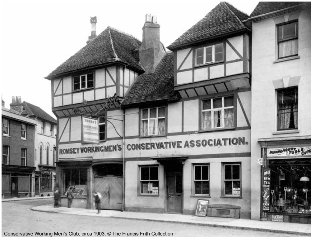
Conservative Working Men's Club, circa 1903.