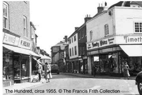
The Hundred, circa 1955.

now flows under the road between Superdrug and Boots. It can be seen in the bus station and is part of the Fishlake.