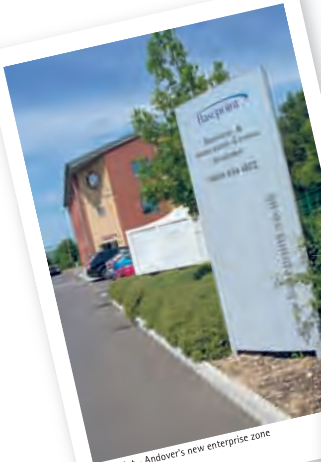
Basepoint - Andover's new enterprise zone

To that end, the former Andover Airfield is already being converted into a business park and will offer a range of office, industrial and storage facilities for local and incoming enterprises. The Andover Industrial Estates Regeneration Project will also oversee the successful transformation of redundant land and buildings at Walworth Industrial Estate into a nationally significant, state-of-the-art site for 21st century business development.