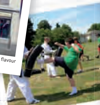
New sports opportunities for all