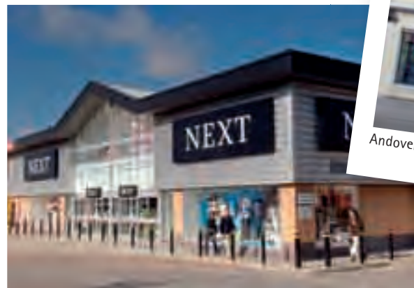
Great new retailing is coming to Andover