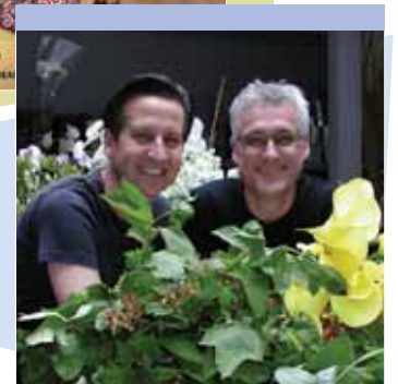
The Bloomsbury Boys

For tickets for these events, to join the mailing list or for further information, call The Lights Box Office on 01264 368368 or visit www.thelights.org.uk