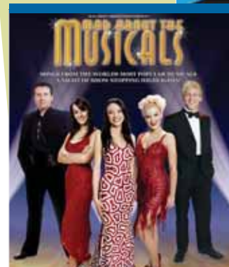
Left: Songs from the World's most popular musicals.