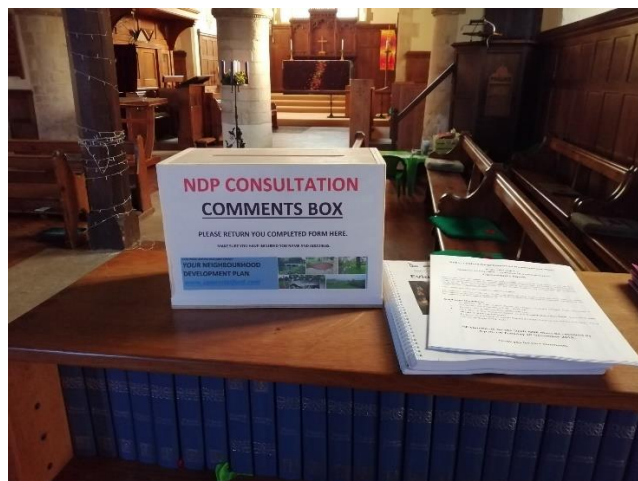
Draft Plan documents and comments box in All Saints Church