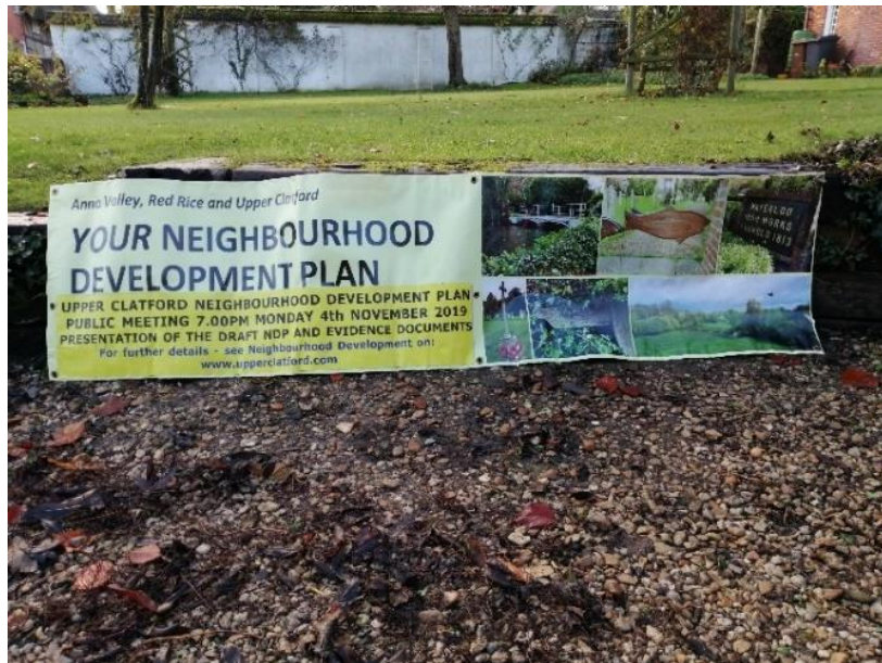
Banner advertising the consultation on the draft Plan

6.5 Full details of individual comments as submitted, 5 the Parish Council response and any relevant amendment can be seen on the spreadsheet at https://www.upperclatford.com/community/upper-clatford-15048/the-document-centre/ .