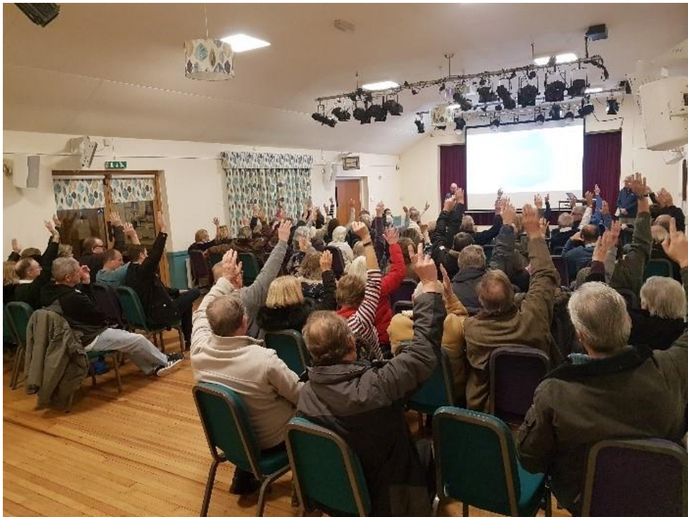
Public show of hands in favour of preparing the Upper Clatford NDP, November 2018