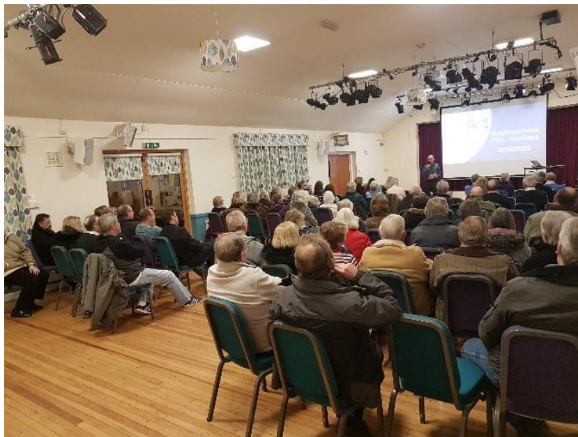
Feedback meeting November 2018