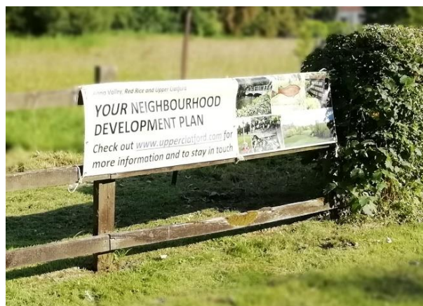
One of the four banners erected around the villages to publicise the NDP