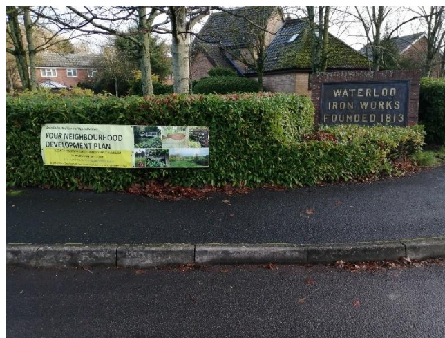
Banner advertising the draft Plan consultation

5.8 Consultation was by email or letter, sent by the Parish Clerk at the start of the consultation period and explaining where the Plan could be viewed and how and by when to make comments.