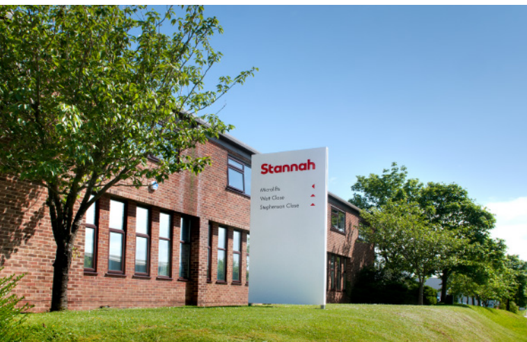
Stannah Stairlifts HQ, Portway East Business Park, Andover

The following section outlines the Council's role in relation to that of the Government. Finally, the report offers a brief update in relation to the actions from the original Economic Development Strategy.