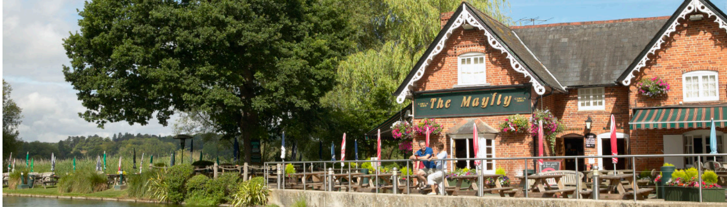
The Mayfly, Fullerton