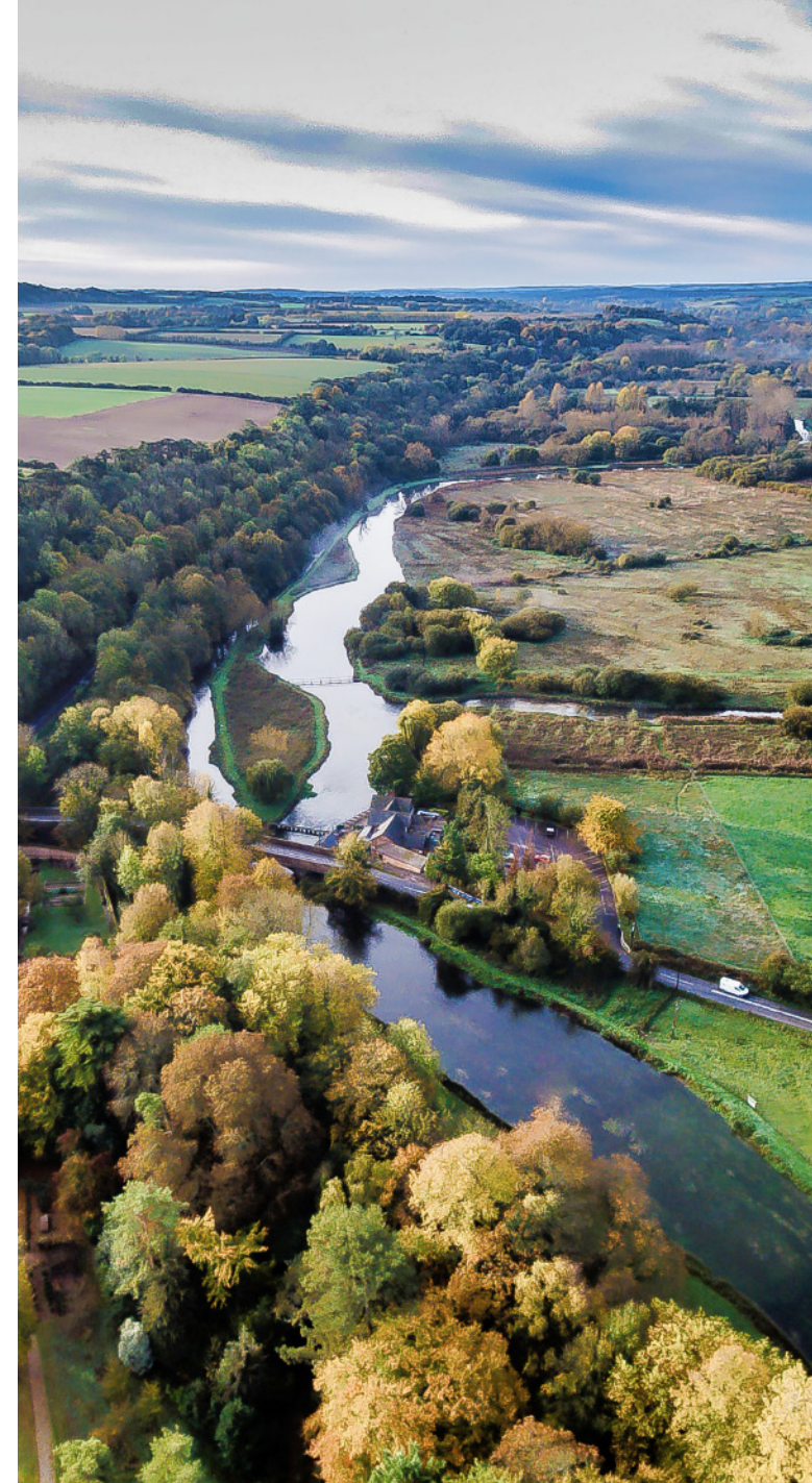
The Anton at Fullerton

iv https://enterprisem3.org.uk/revive-and-renew