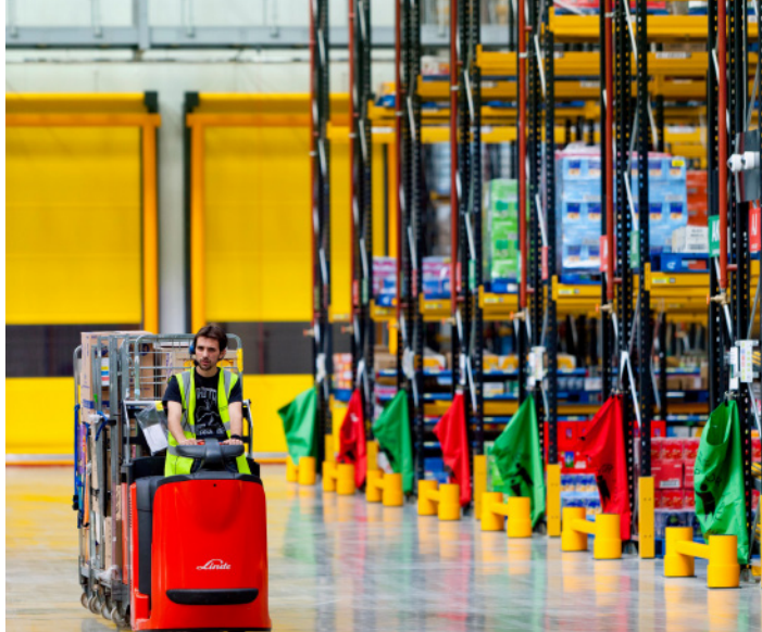
Co-op Distribution Centre, Andover Business Park