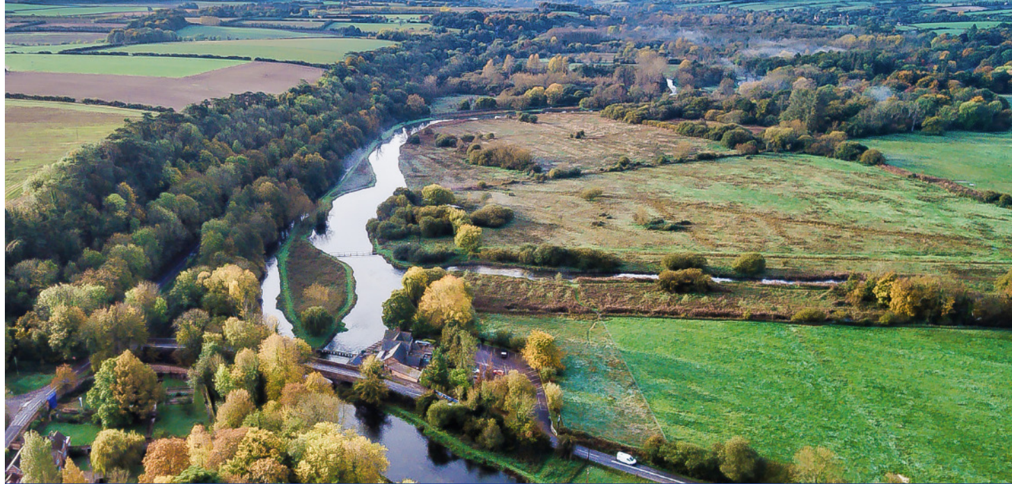
The Anton at Fullerton

The Local Economy Recovery Action Plan already demonstrates how the Council has been proactive in seeking to achieve a more resilient economic base moving forward. In establishing masterplans for Andover and Romsey town centres in a timely fashion it has put in place the building blocks to enable the centres to be able to take advantage of the economic recovery whatever the nature of those centres will be in the future. This Interim Strategy was approved by Cabinet on 13 January 2021.