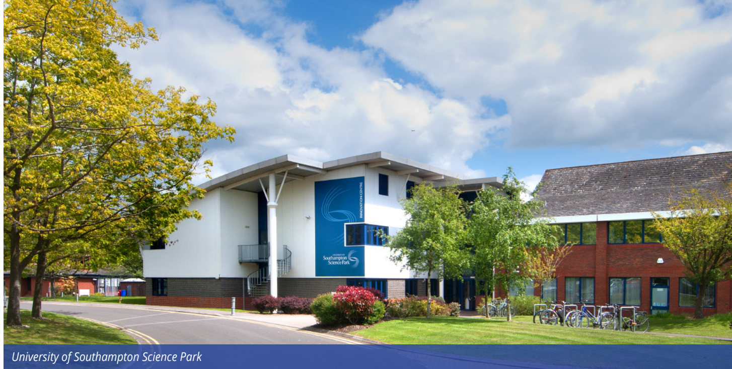
University of Southampton Science Park

The EM3 Recovery and Renewal Action Plan identifies 6 inter-related priorities all of which are relevant to Test Valley's economic recovery: