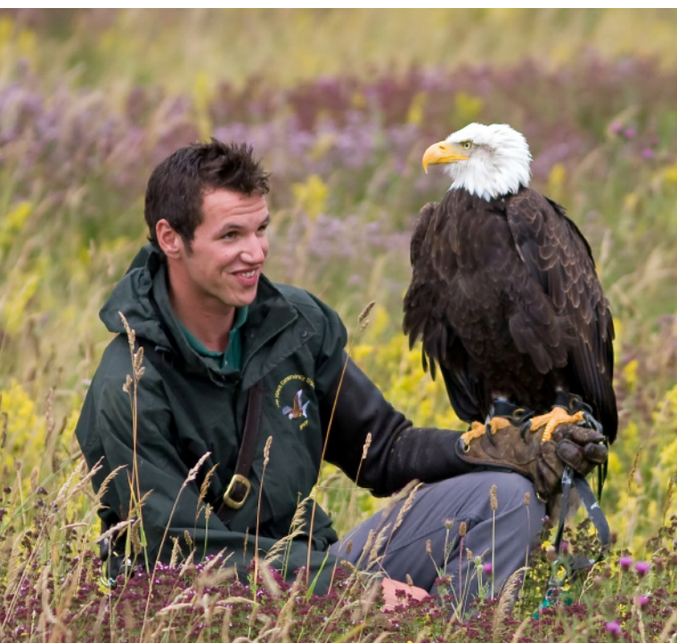
Hawk Conservancy Trust

The recent consultants' review of how the Council supports tourism, the move towards more online marketing and the exceptional opportunity to attract "staycation" visitors in 2021/22 augurs well for the recovery of the visitor economy in Test Valley from 2021 onwards.