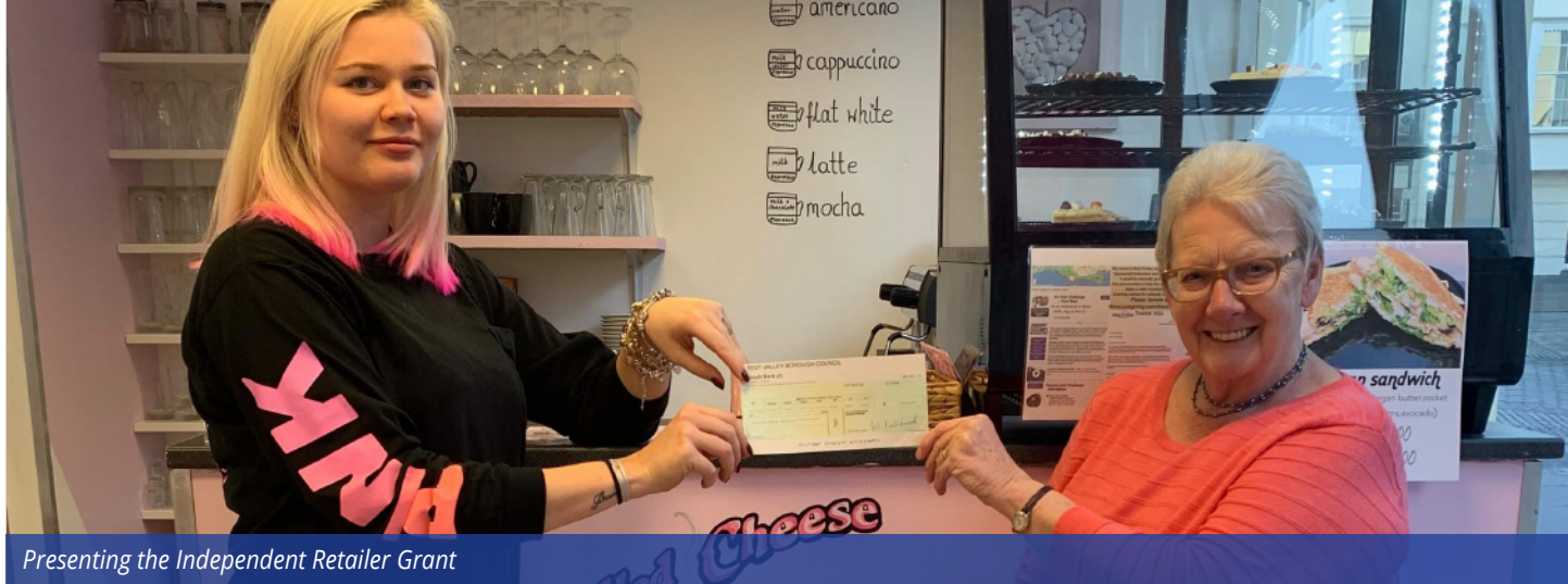
Presenting the Independent Retailer Grant

As noted above, over the medium term there is an opportunity to retain those who are working from home instead of making long commutes by