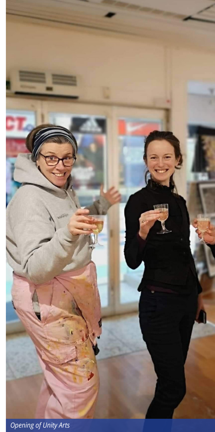
Opening of Unity Arts

The interim strategy describes our understanding of how Covid-19 and the lockdowns are affecting our residents and businesses and sets out the Council's response. The Council will support its residents and businesses to help provide the resilience that our community and economy will require for the longer term. We will continue to deliver business grants as well as many other forms of support and over the longer the Council has put in place the building blocks to enable our town centres to recover to serve their communities.