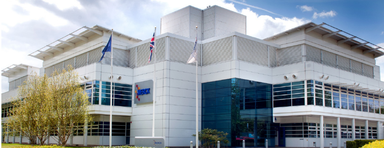
Former Merck building, University of Southampton Business Park

The Council is also working closely with another EU funded energy reduction scheme called Green Tech South https://greentechsouth.com/ based at Portsmouth University which has delivered thousands of pounds of grant to Test Valley businesses.