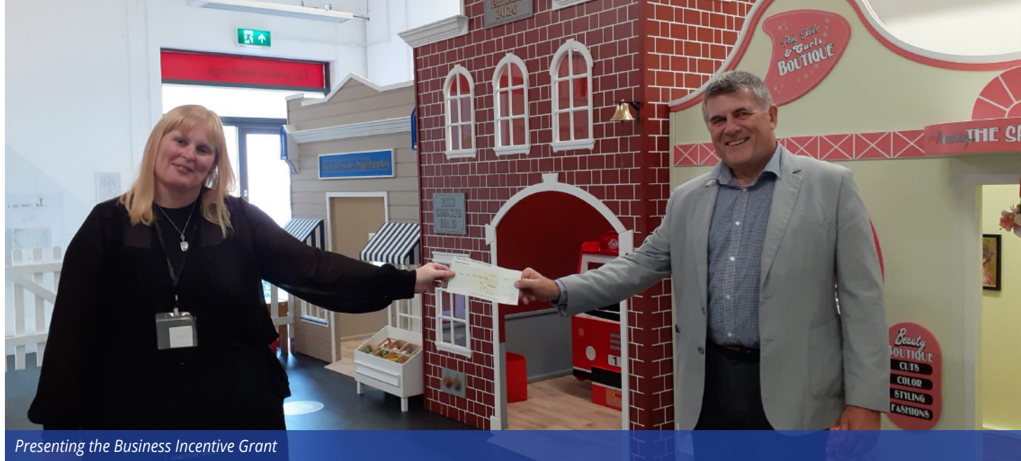
Presenting the Business Incentive Grant

During the first lockdown community facilities not only acted as volunteer hubs but switched to delivering local produce. The increase in working from home and demand for local services is also likely to be of longer term importance.