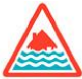
SEVERE FLOOD WARNING

Move family, pets and valuables to a safe place. Turn off gas, electricity and water supplies if safe to do so. Put flood protection equipment in place.