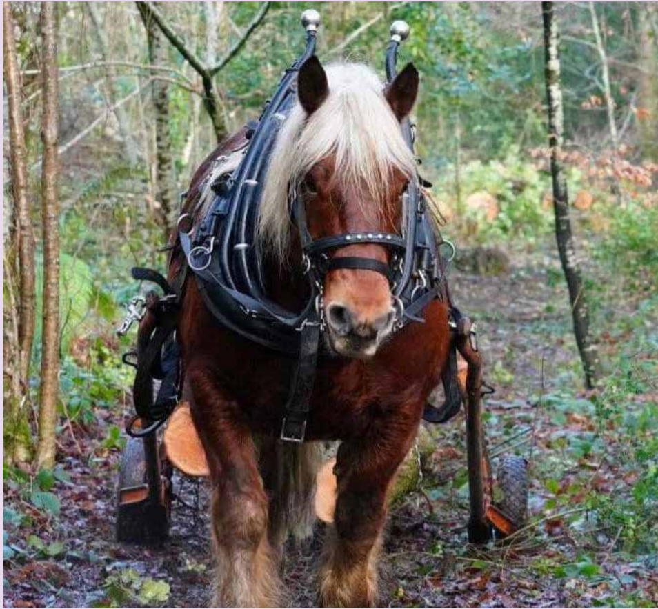
A pair of heavy horses have been helping as part of the operation around ash dieback disease down at Valley Park Woodland Local Nature Reserve.

This winter, two Comtois horses, Rita and Tookie, have been hard at work moving the felled ash trees out of the woods. Sadly, due to ash dieback, many of the borough's ash trees need to be felled to ensure the public's safety.