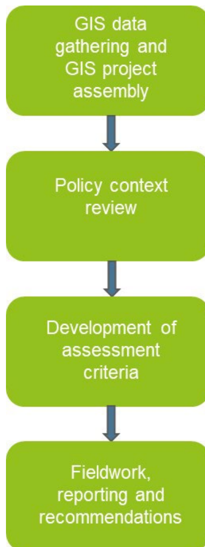
Figure 2.1: Summary of study methodology

2.1.2 GIS data gathering and GIS analysis project assembly: Available and relevant spatially referenced data was collated in GIS to inform a detailed desktop assessment in relation to existing and proposed Local Gaps. The following data were collated and reviewed for this stage: