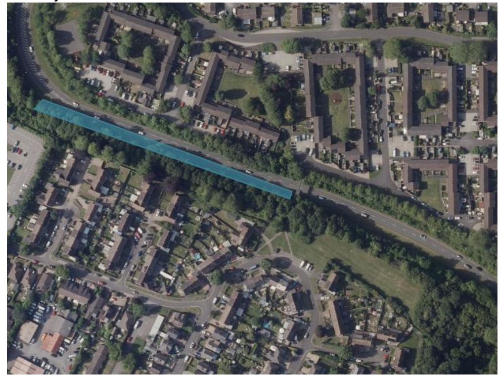
Junction of East Portway and Weyhill Road - 2561 m2