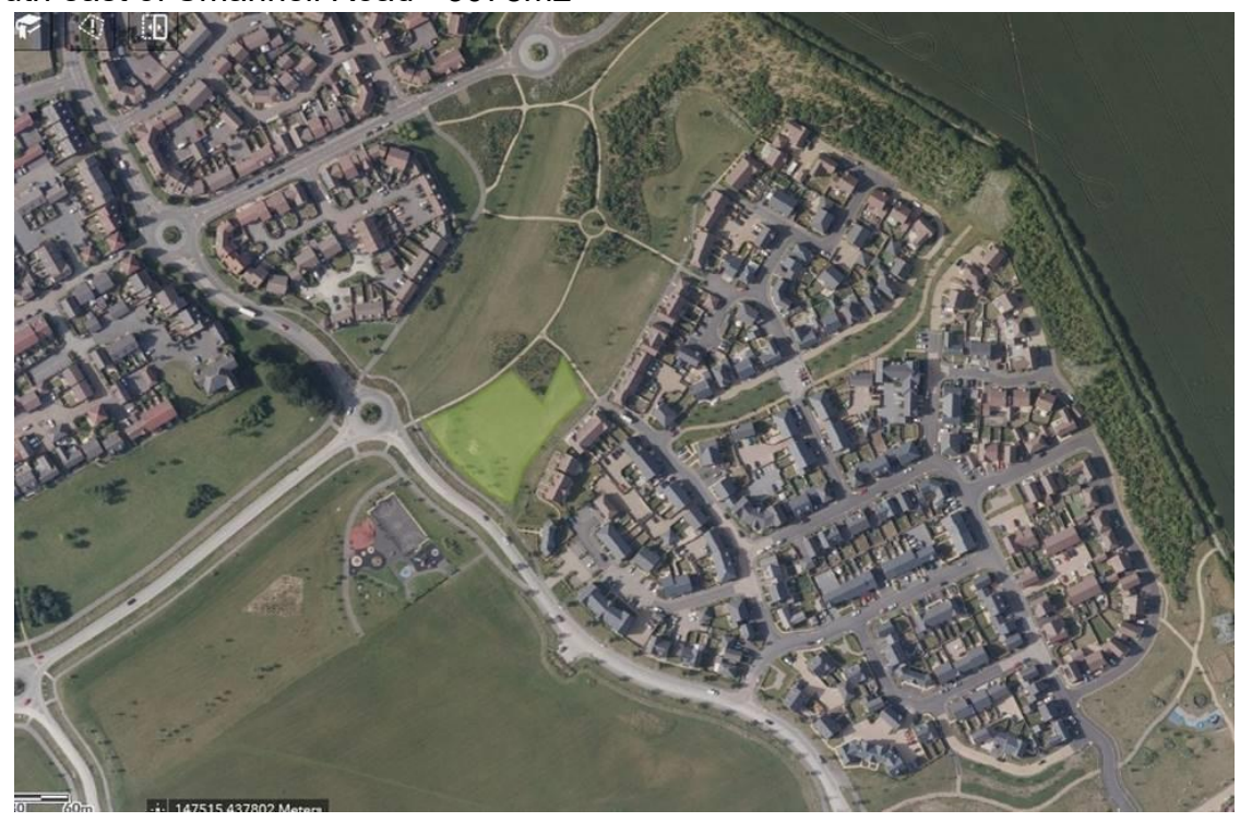
Augusta Park – north of Smannell Road - 970 m2