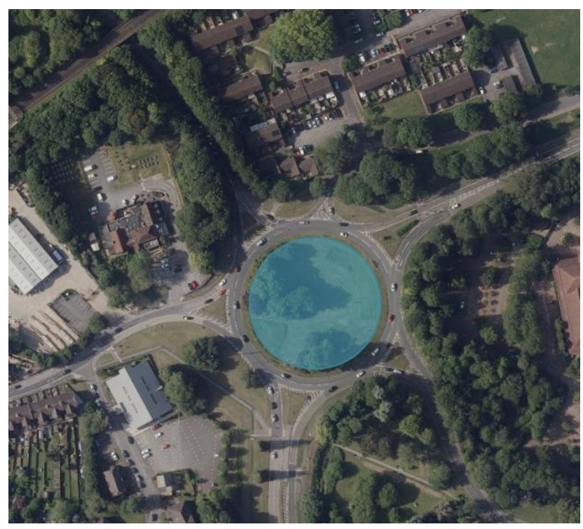
Enham Arch roundabout - Total 5659 m2 (HCC GRASS)