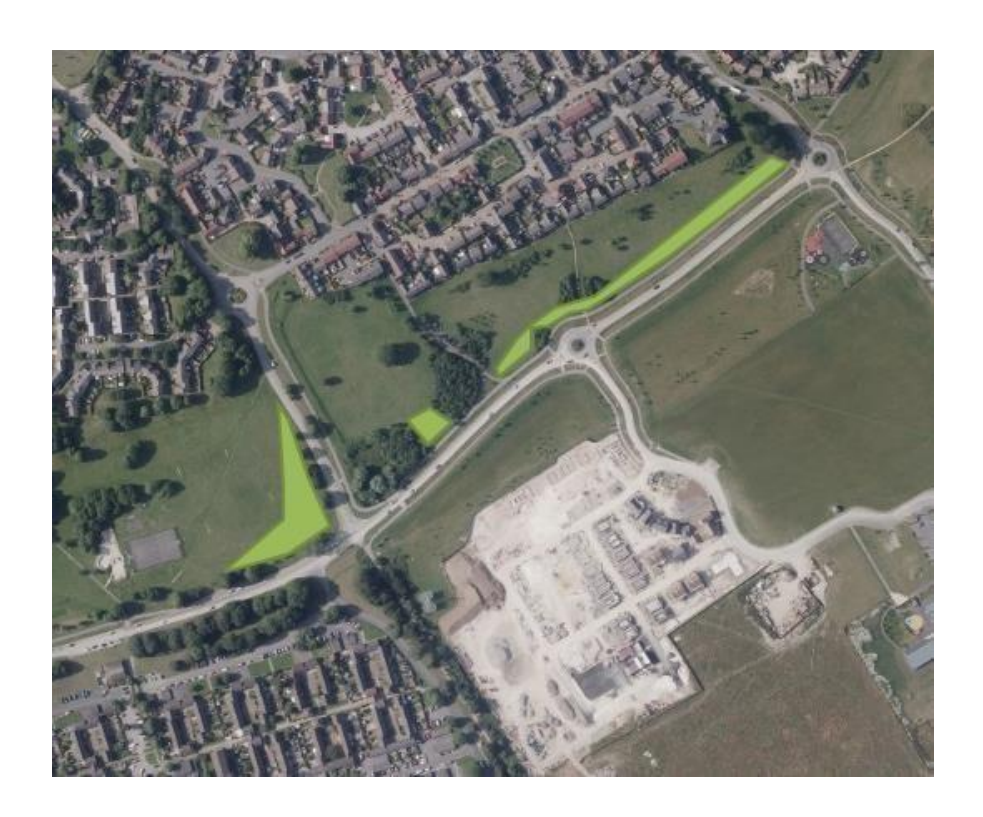
Smannell Road - 7094m2 \, - Overseeded in 2024 with General purpose meadow mix.