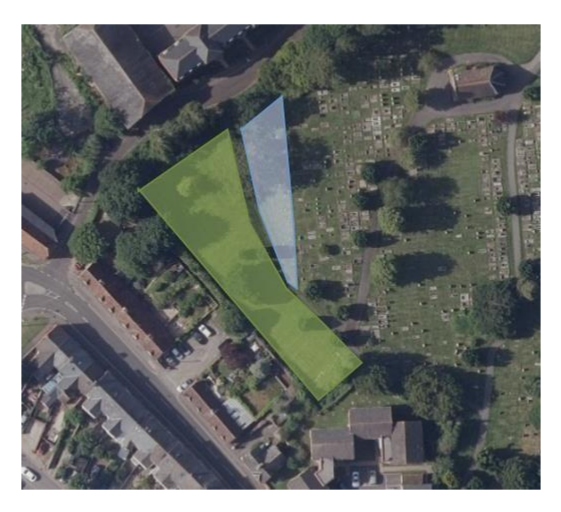
The Folly roundabout - Total 3659m2 (HCC GRASS)

St Mary's church total 1603 m2 Green (continued from 2021) - 1221.5m2 Blue 2022 addition - 382m2