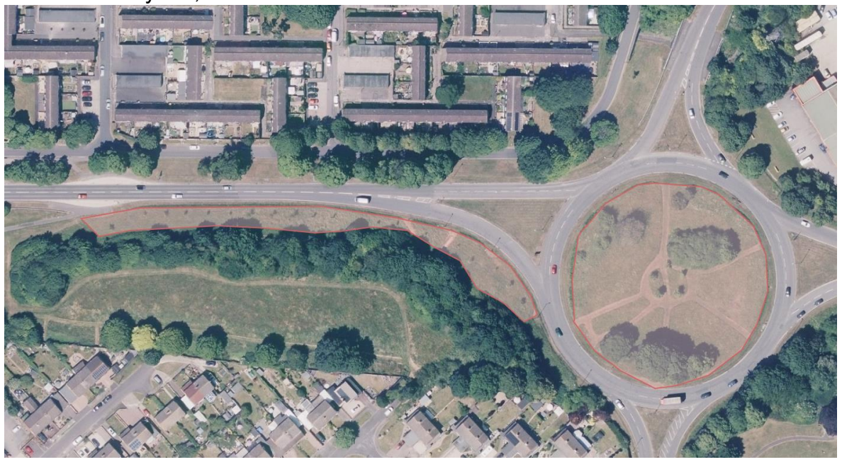
Vigo Recreation Ground – 177.1m2 formal boarder removed and sown with Meadowscape Pro Native Enriched