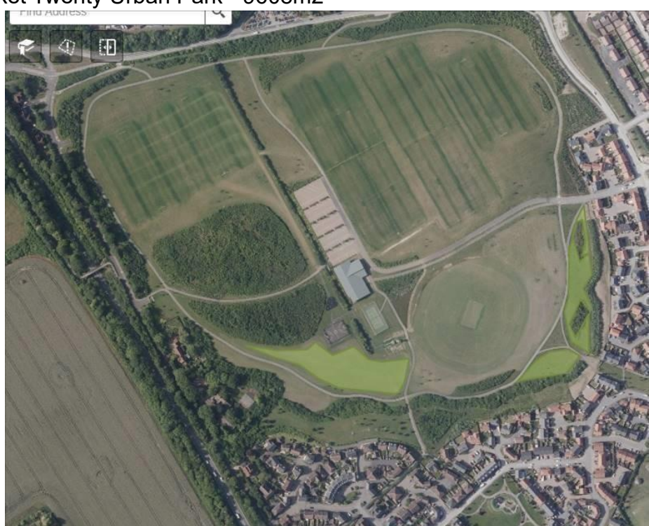
Picket Twenty Urban Park - 3382m2