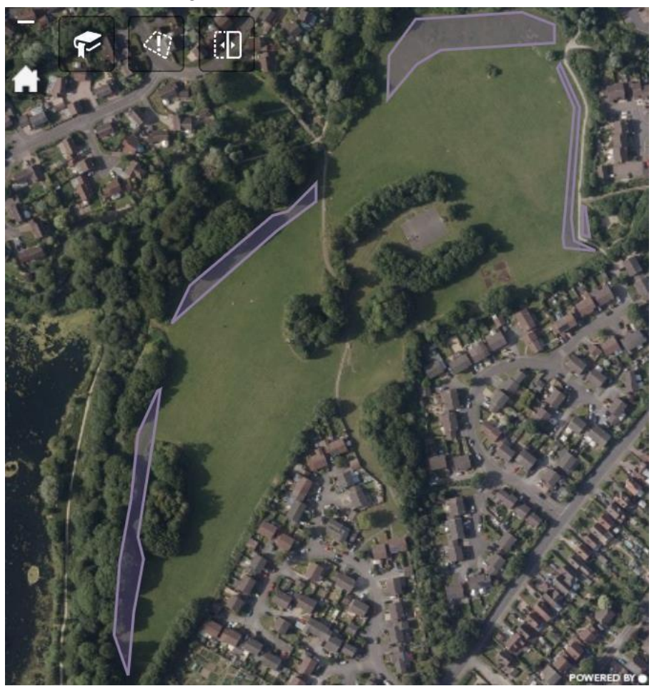
Mead Hedges - Total 1,702.4 m2