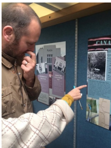
Visitors reading the information panels about the project