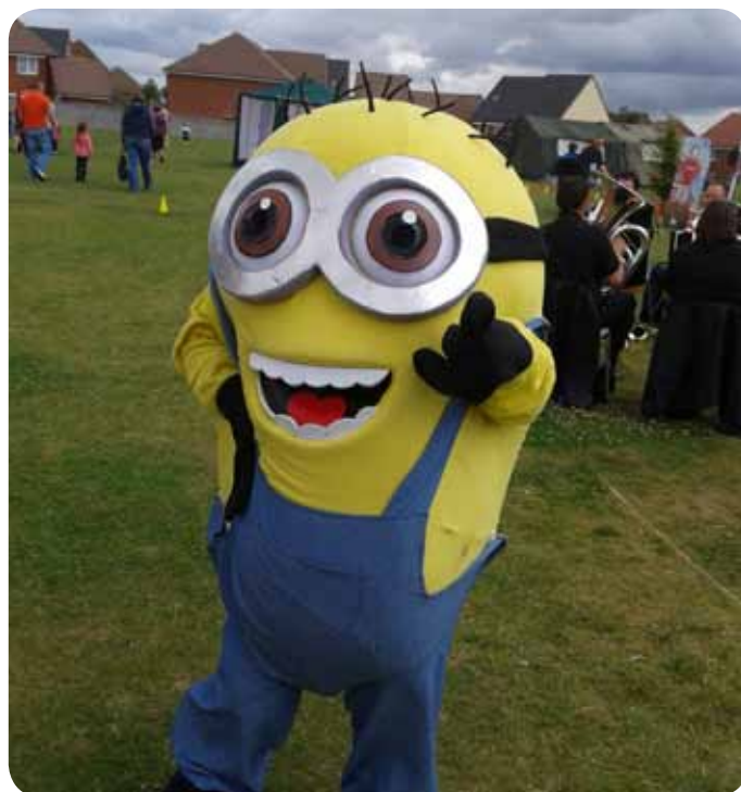
Minion costume courtesy of Paul's Party Pals