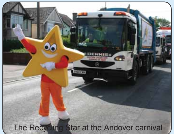
The Recycling Star at the Andover carnival

To find out more visit www.testvalley.gov.uk/recyclingstars and, for a chance of winning great prizes, residents can "like" Recycling Stars on Facebook.