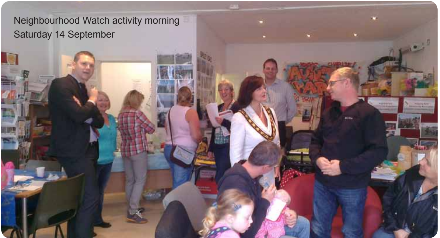
Neighbourhood Watch activity morning Saturday 14 September