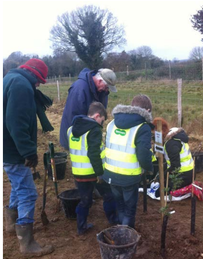
Planting Endeavour School's section of hedge