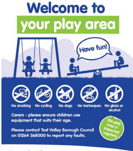
Above: New signage now in place at Quicksilver Cove Play Park on Quicksilver Way