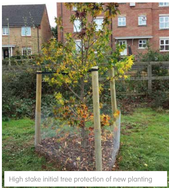
High stake initial tree protection of new planting

There are British Standards for tree selection (BS3936_1), nursery stock and root balled tree guidance (BS4043) and these are available from www.standards.uk.com