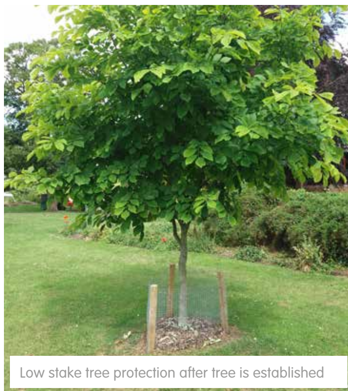
Low stake tree protection after tree is established