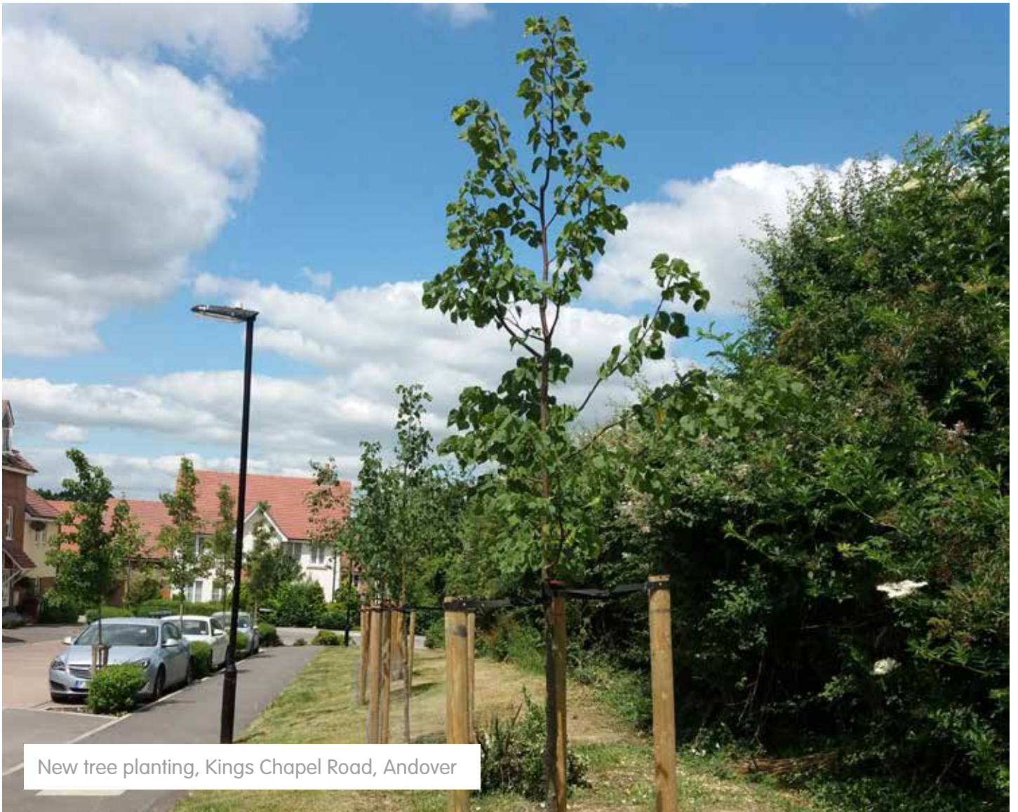
New tree planting, Kings Chapel Road, Andover