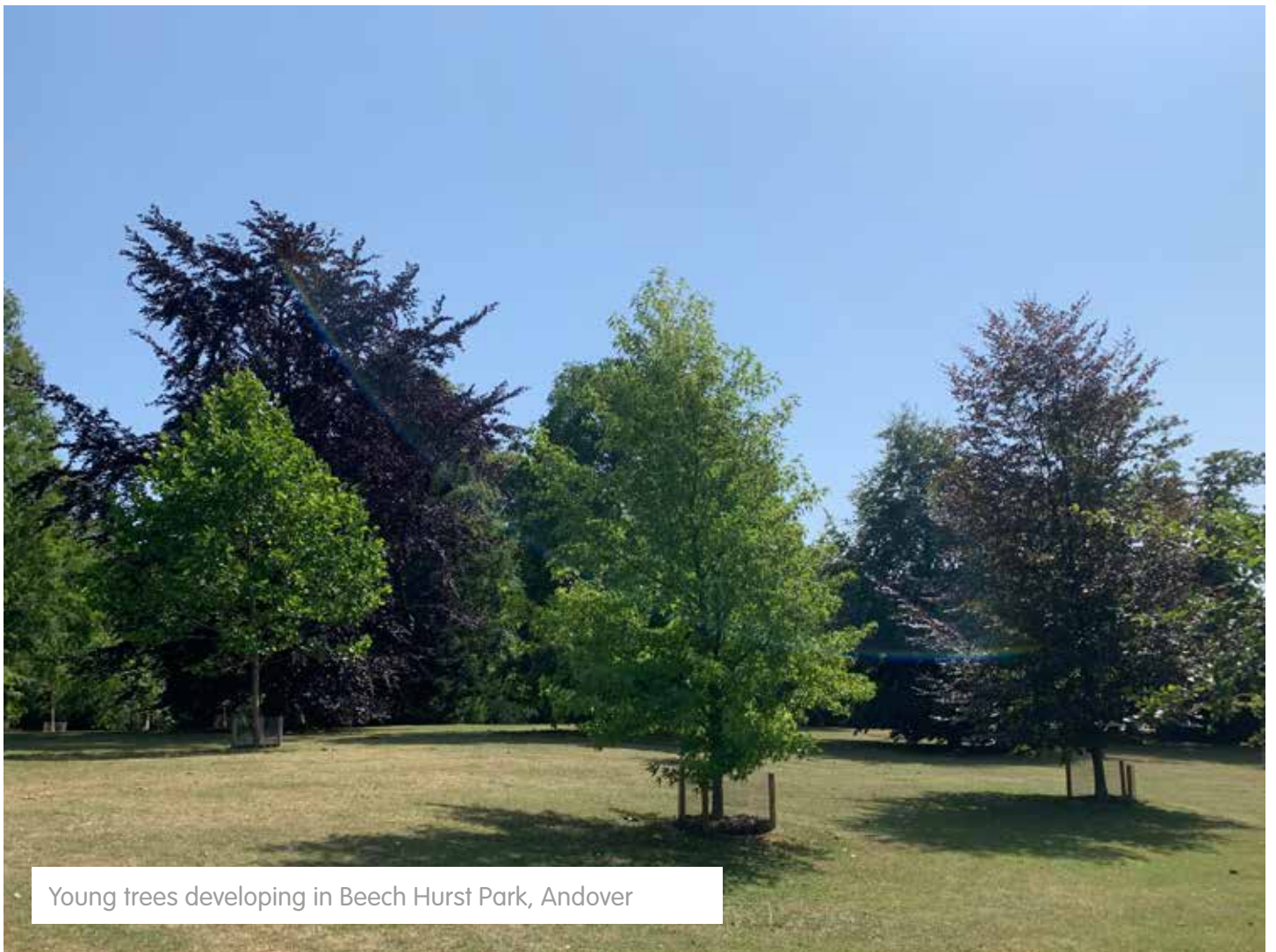
Young trees developing in Beech Hurst Park, Andover