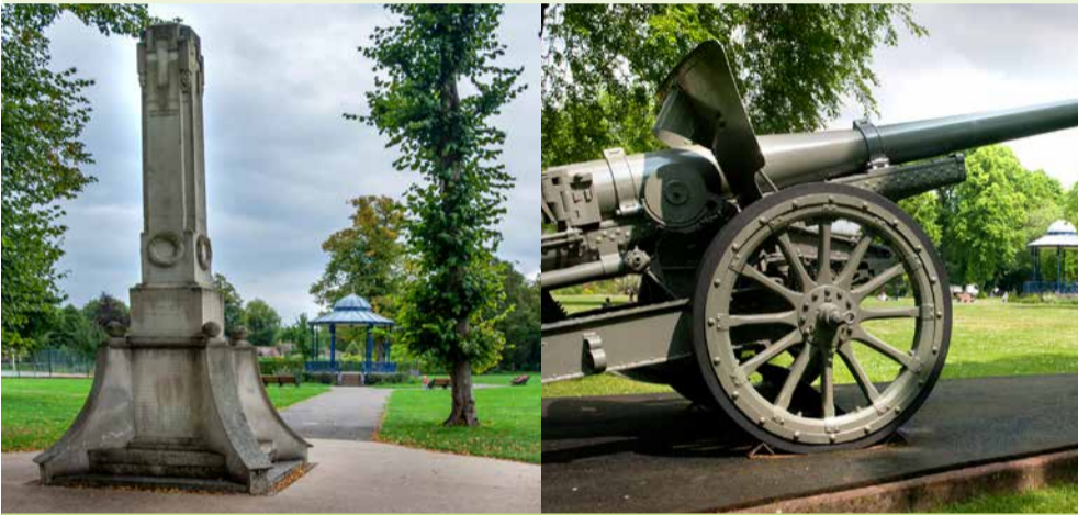
Romsey War Memorial Park achieves a decade of Green Flag Awards

Each park or open space has a comprehensive management plan which includes tree inspections, play park checks and general maintenance, along with long-term plans to further enhance the areas even in future.