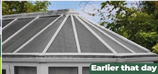
Earlier that day

2 FREE PANELS THIS MONTH * Quote Ref TVN1118